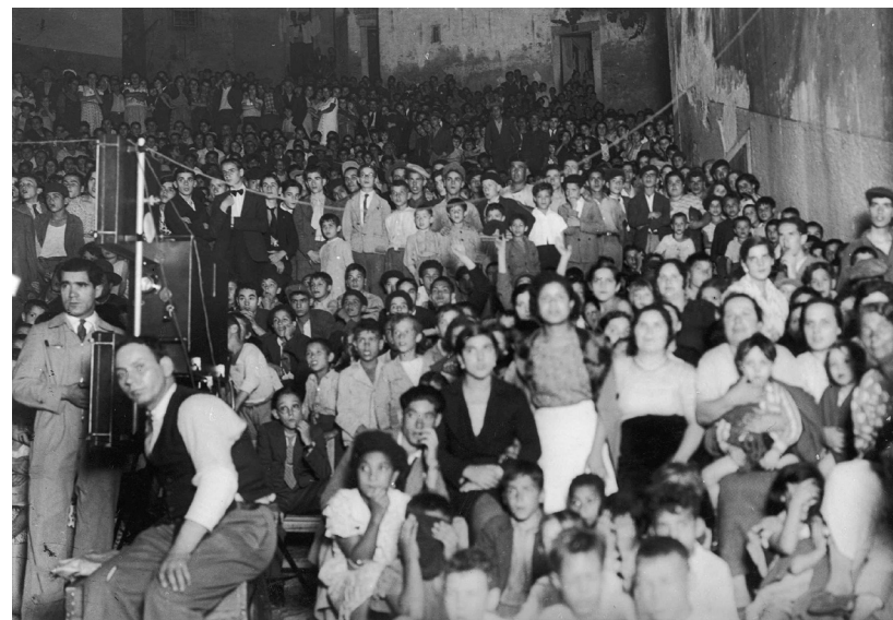
Séance du «Cinema do Povo», 1935, Mouraria, Portugal