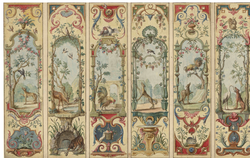
Pierre-Josse Perrot, Six Feuilles de Paravent sur les Fables d'Ésope tissées à la Savonnerie , 1739, crayon noir, plume et encre brune, aquarelle, gouache, 40 x 64,3 cm, Bibliothèque Nationale de France, Paris