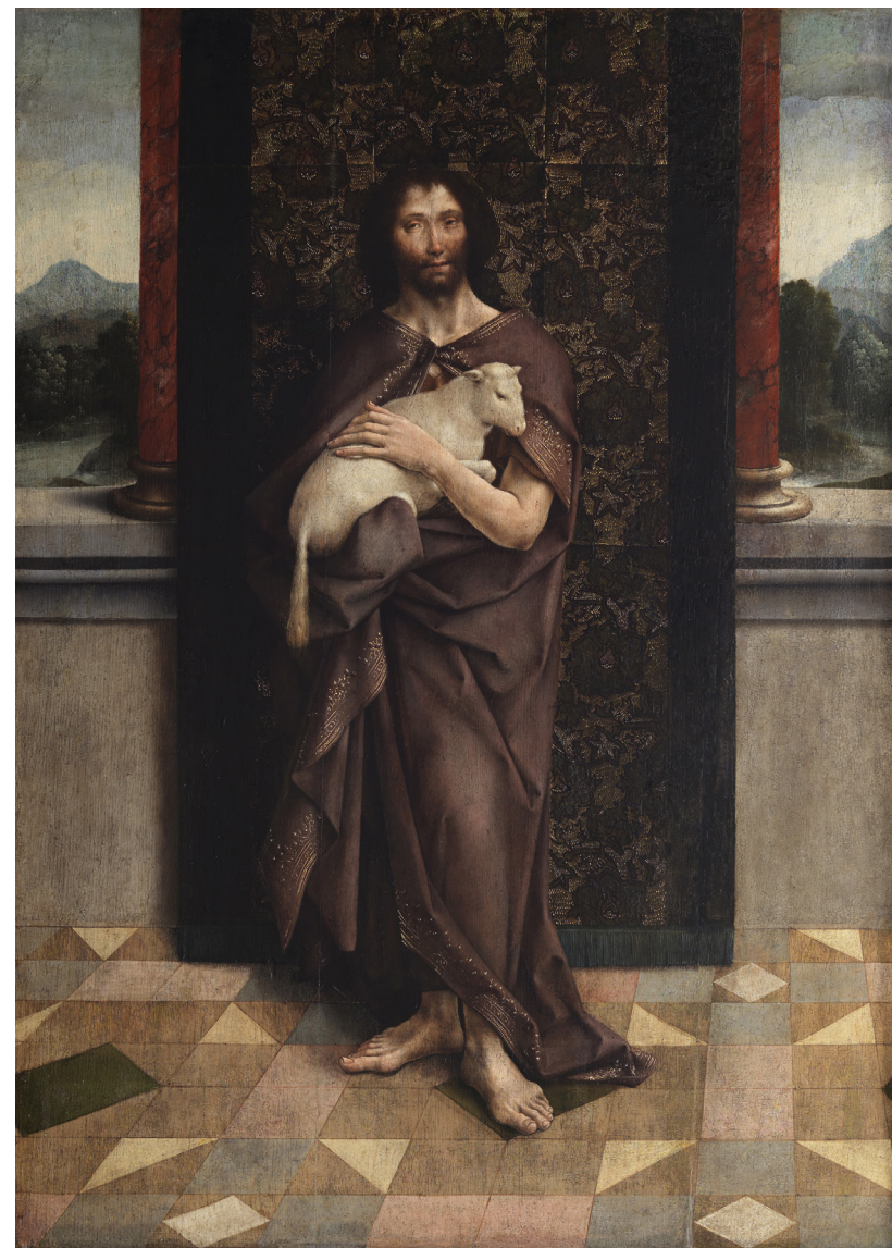
Frei Carlos, Le beau Pasteur , c. 1520, huile sur panneau de bois de chêne, Lisbonne, Museu Nacional de Arte Antiga