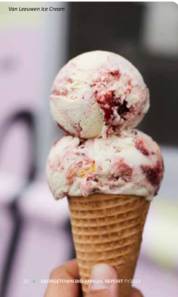
Van Leeuwen Ice Cream