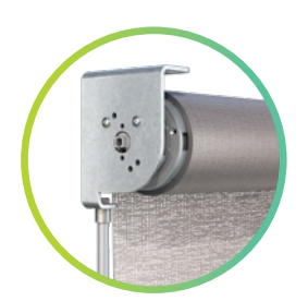
∑ 12 m²