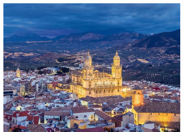
View of cathedral of Jaén

The city was conquered by the Christians in 1245. Queen Isabella met Columbus in Jaén and agreed to pay for his voyage that led to the discovery of America.