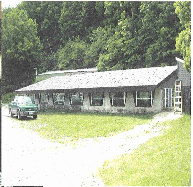
Broodstock Raceway Project