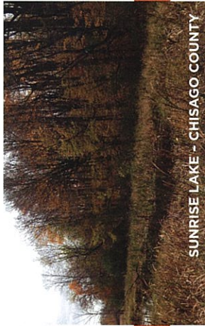
SUNRISE LAKE - CHISAGO COUNTY

THE FOLLOWING PROJECTS WERE FUNDED BY LAND TRUST MEMBERS AND WITH THE GENEROUS SUPPORT OF THE MINNESOTA ENVIRONMENT AND NATURAL RESOURCES TRUST FUND AS RECOMMENDED BY THE LEGISLATIVE-CITIZEN COMMISSION ON MINNESOTA RESOURCES (LCCMR).