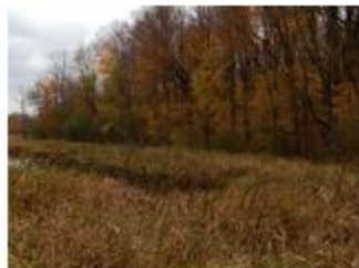
The shallow wetlands on Joan's property are part of a major migratory route for waterfowl and songbirds.

The natural and undisturbed forests, grasslands and wetlands of this property create attractive habitat to support a wide range of species such as bald eagle, common tern, osprey, wood turtle, trumpeter swan, yellow rails and sharp-tailed sparrow. It is part of a major migratory corridor for waterbirds and serves as one of the state's most critical areas for spotted salamander and other amphibians.