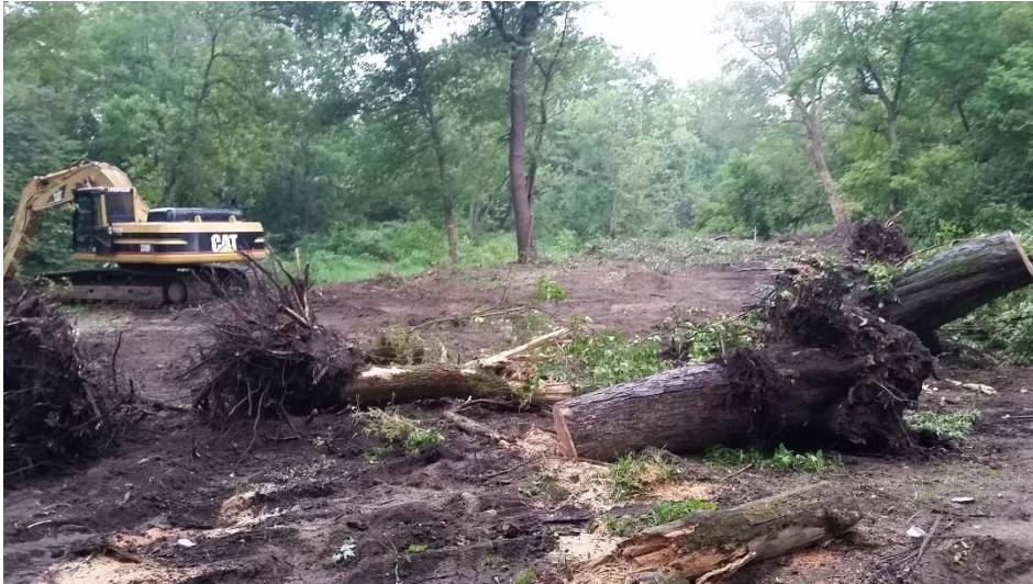
Contractor arrived with 2 excavators to finish tree and debris removal. A large pile of trees and stumps are currently on site. The City is awaiting the Dakota Wood Grinding Company to arrive and haul the woodchips to St. Paul for energy generation.