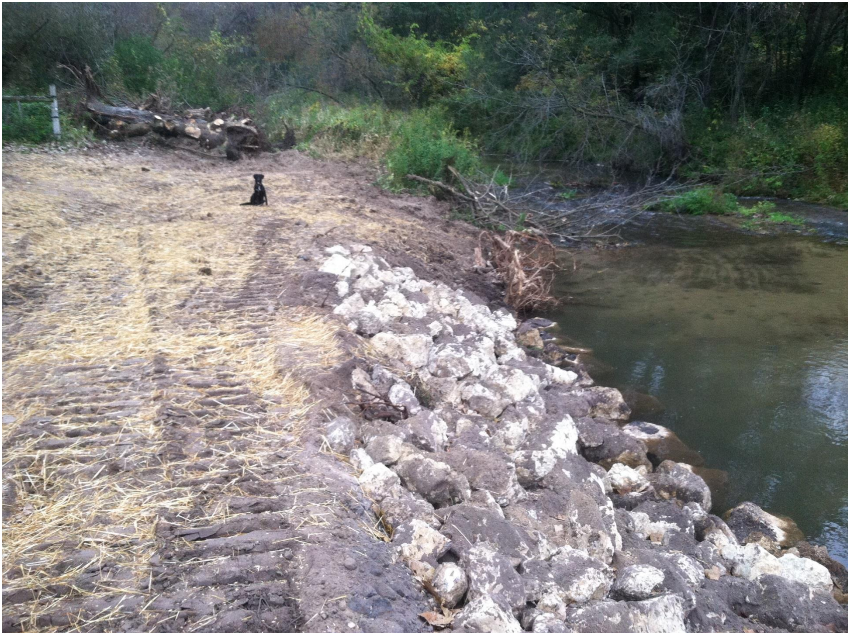
'Bear' the dog and downstream rootwads