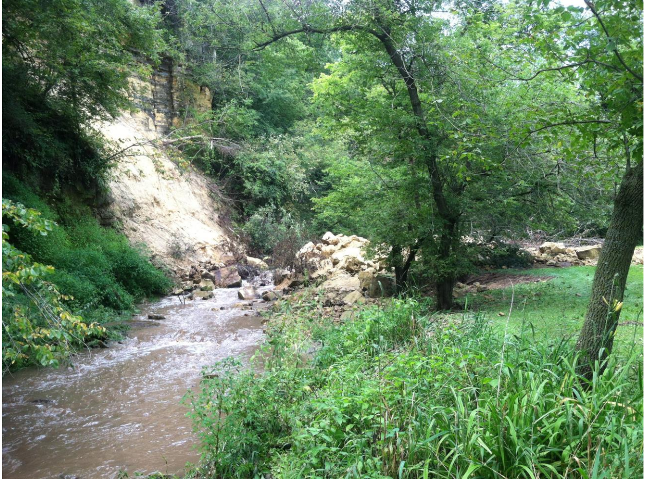
Spring Creek – before removal of obstruction and stabilization of banks