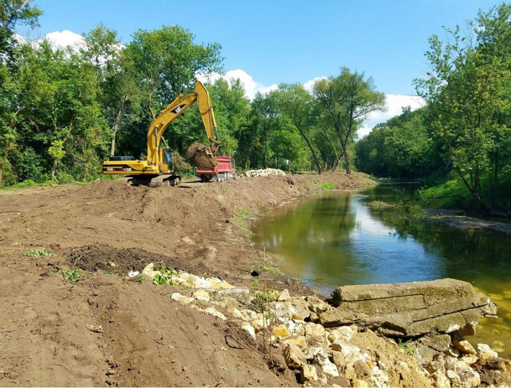
August 2016 Installation of rock riprap around historic dam abutment and begin to shape bankful bench (looking downstream)