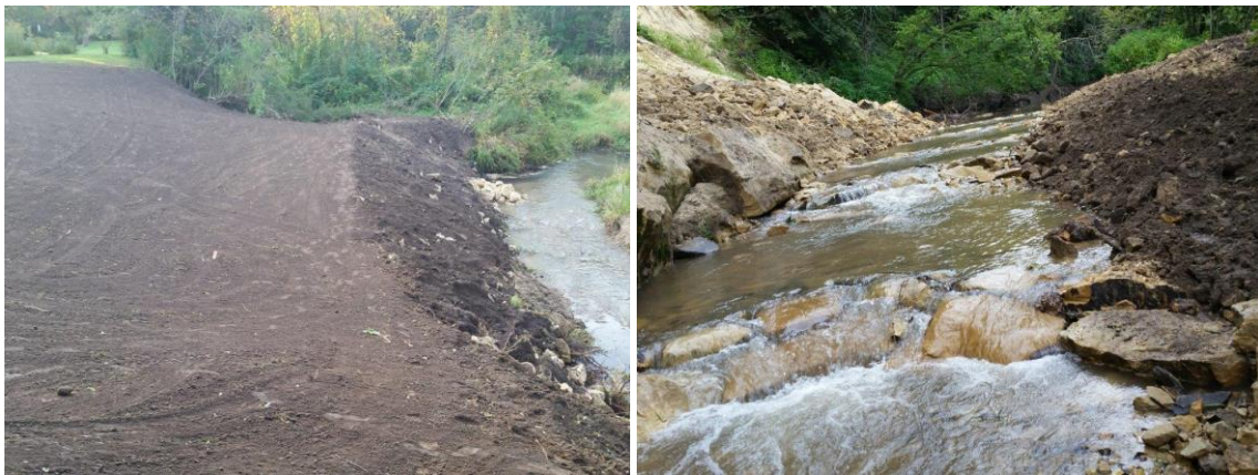
Spring Creek after construction