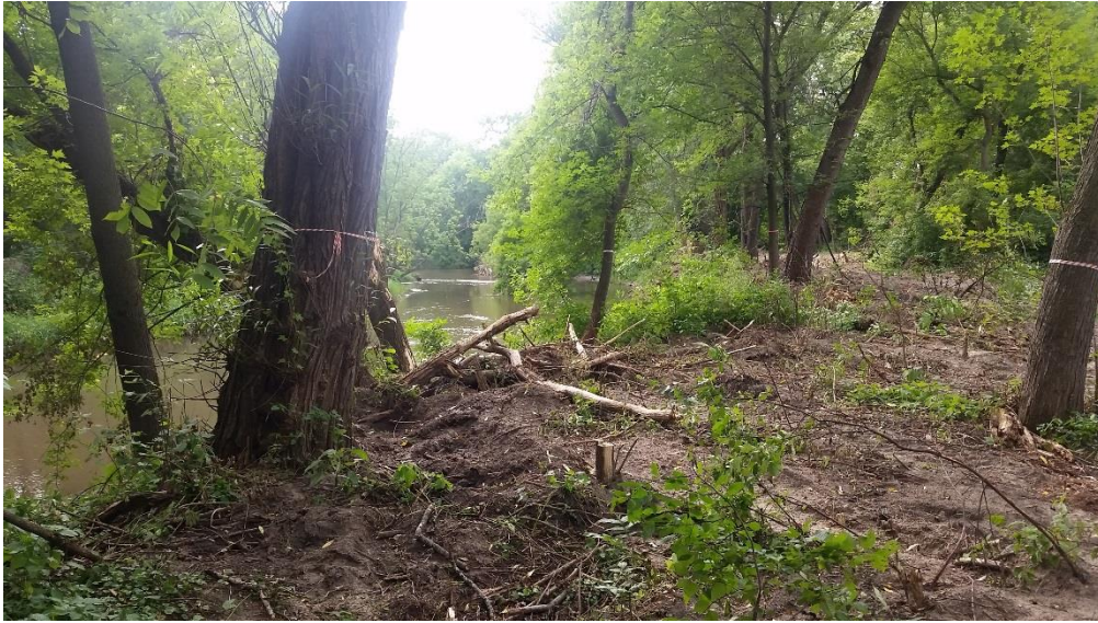
Understory and smaller trees removed by City Staff prior to contractor arriving. Note the flagged trees that were saved during the construction process or used as root balls.