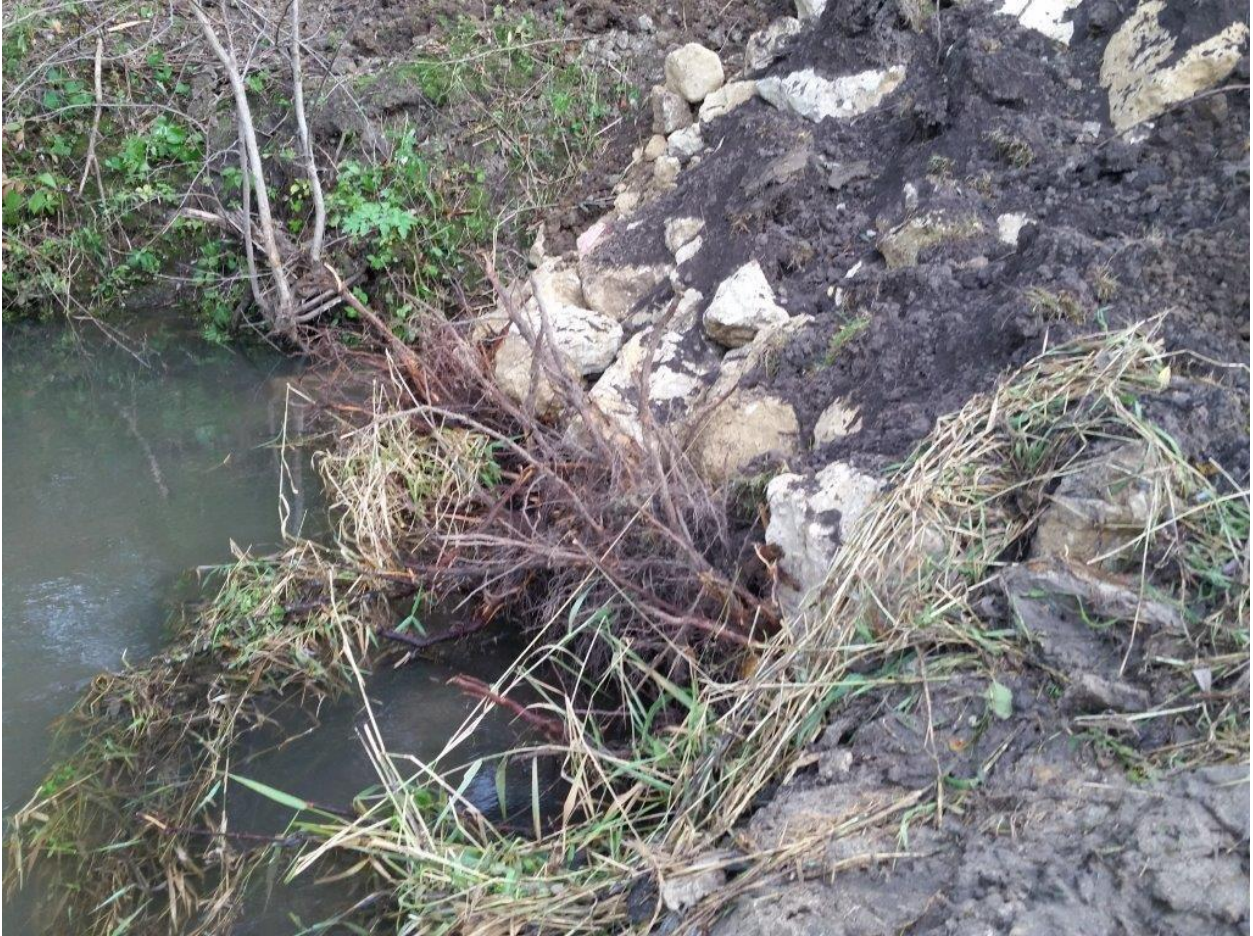
Rootwads placed in with bank stabilization on Spring Creek, Goodhue County. Rootwads provide additional habitat for invertebrates and trout.