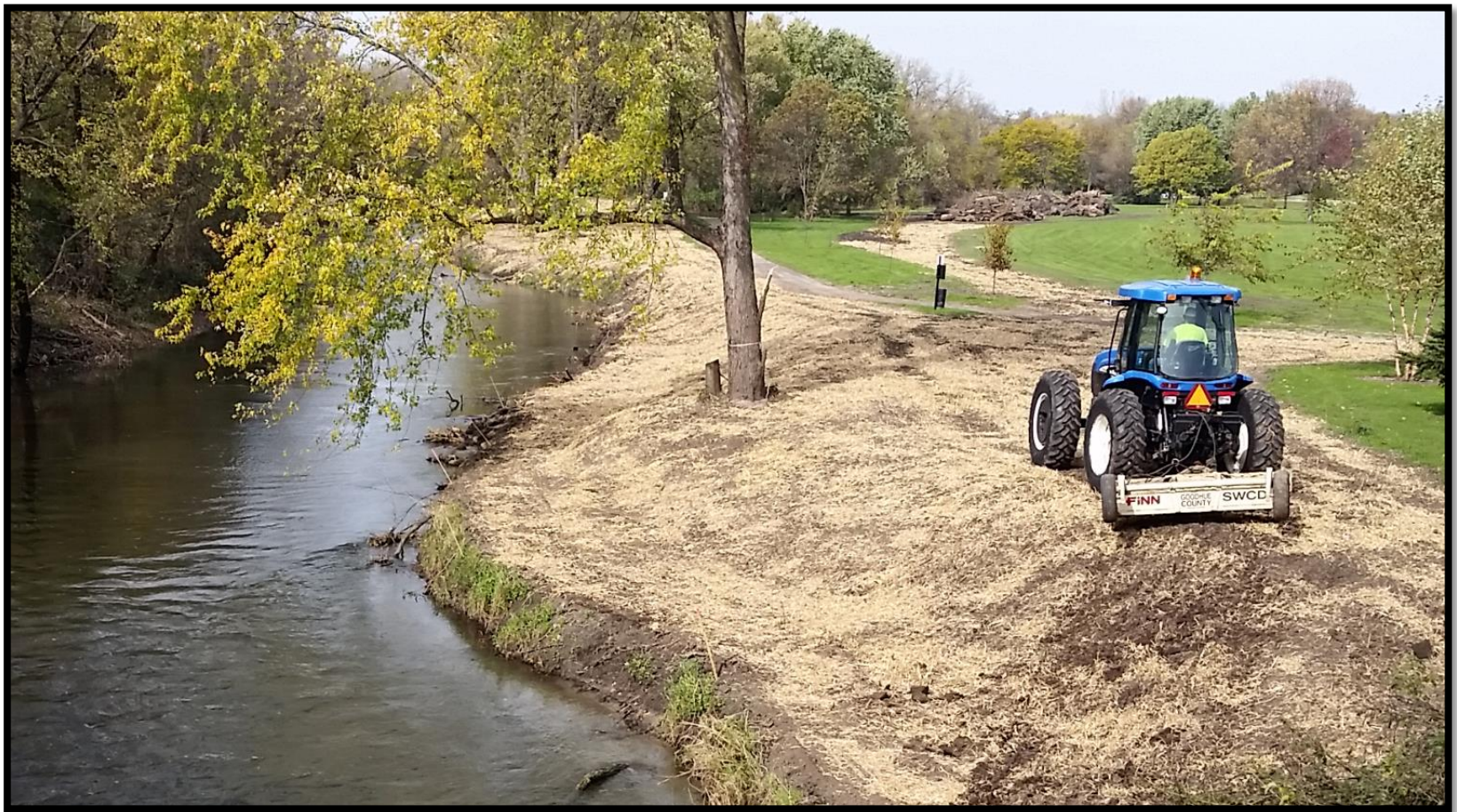
Goodhue SWCD crimper used to anchor straw mulch following cover crop seeding. October 2016