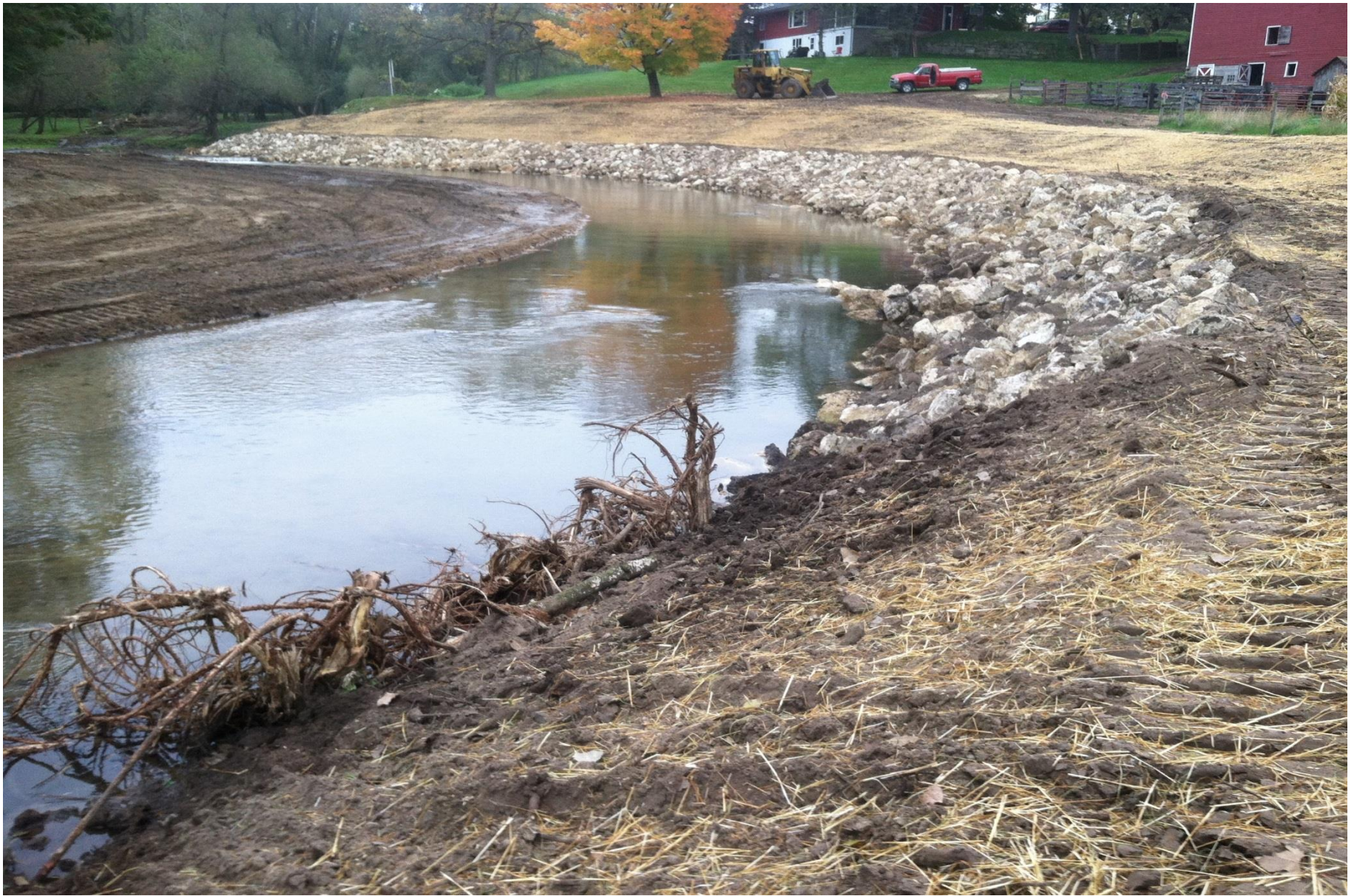
Total Project.... Protecting infrastructure while improving in-stream habitat with rock and woody debris