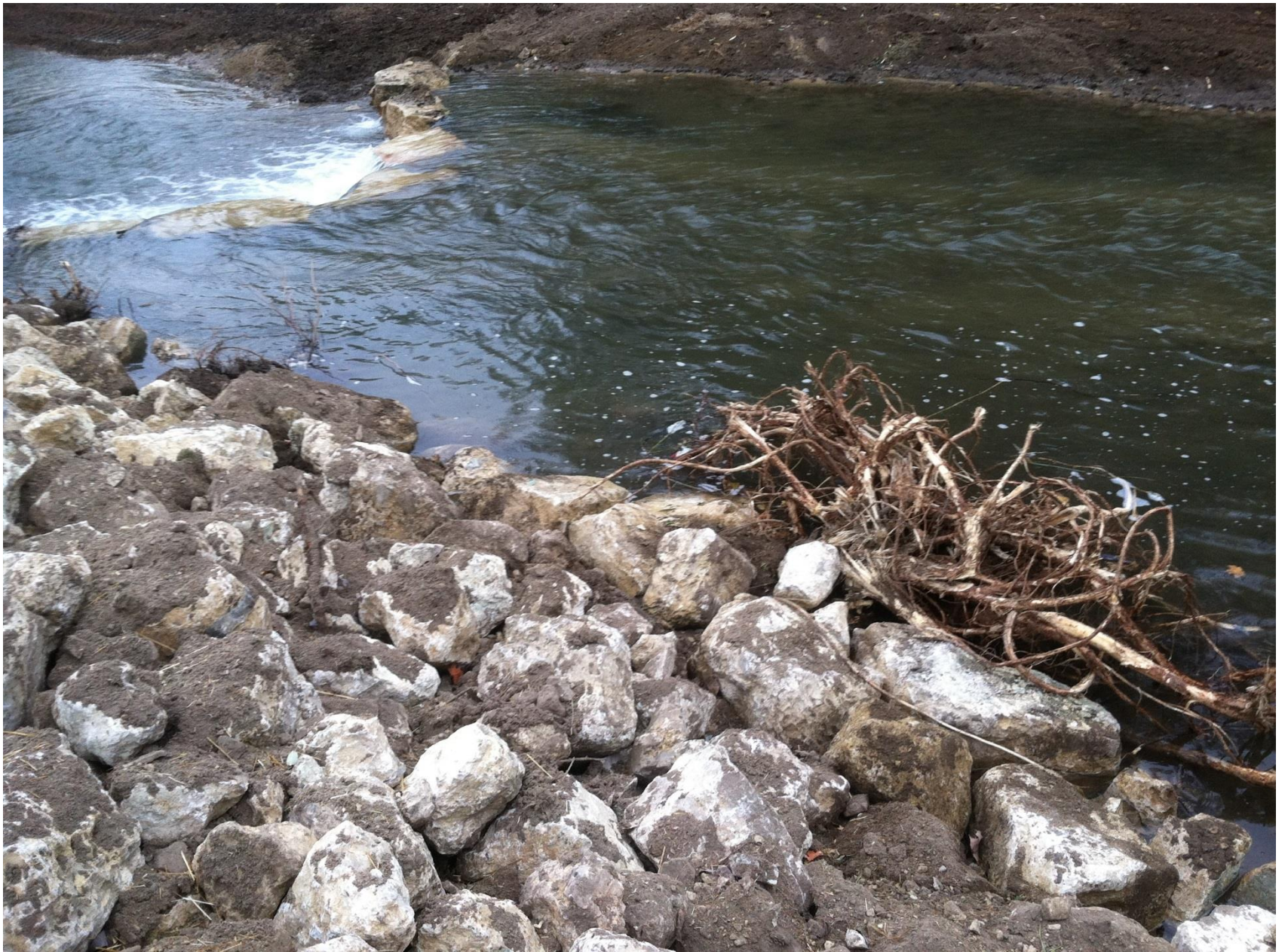
Weir and Rootwad