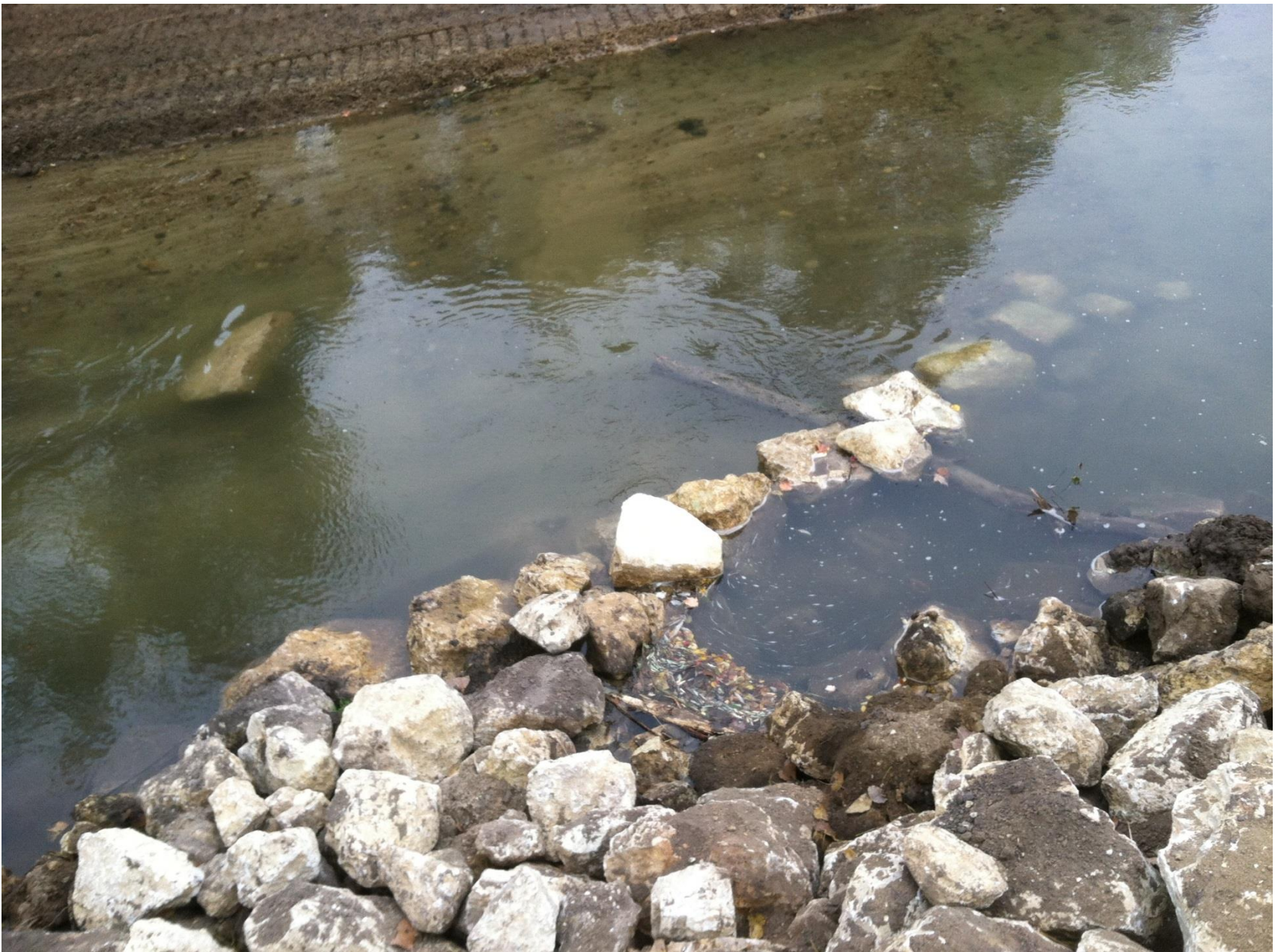
Stream barb w/woody debris and cover rock in pool area