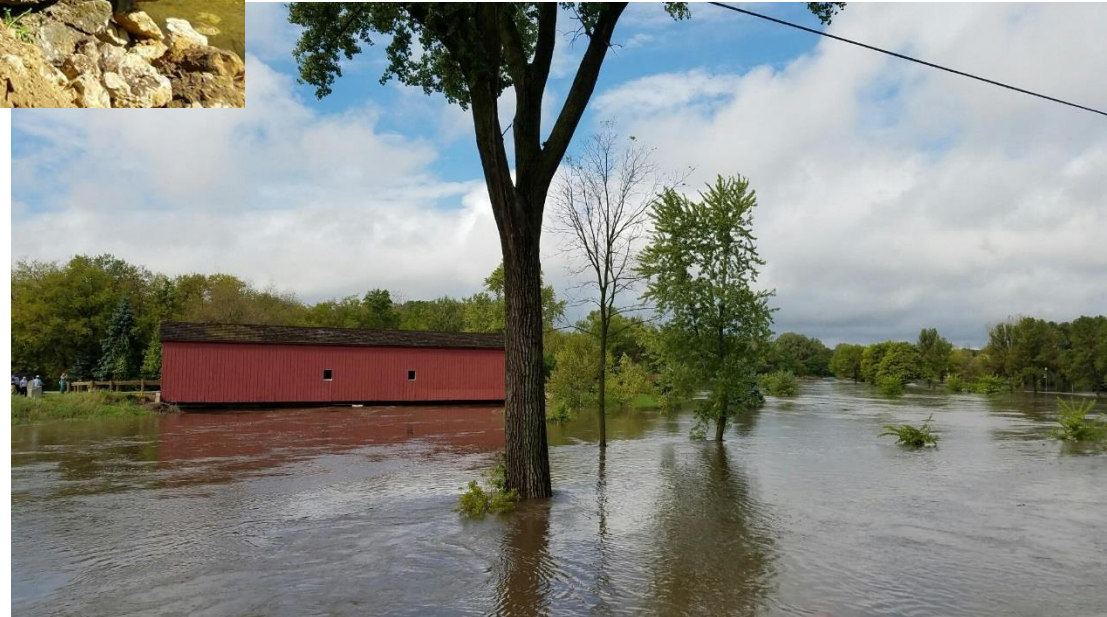
September 22 nd 2016. Watershed receives 6"+ of rain on top of already saturated soils. N.Fork Zumbro Floods from Kenyon to Mazeppa. Record levels in Wanamingo.