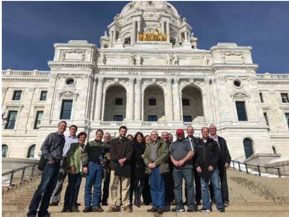
IAM members visited the capital on February 27th to meet with several area Legislators

As of this writing, the spring weather has not been cooperative. When the weather finally changes and you are able to get out into the field, please be careful and have a safe planting season.