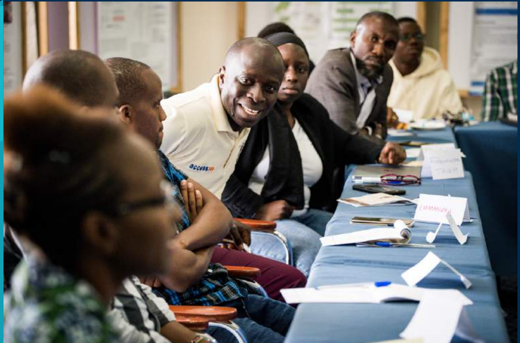
Photo: RSIF PhD student training on the sidelines of the 5th PASET Forum in Kigali, Rwanda, May 2019.

In 2019, University of Ghana (UG) was competitively selected as an RSIF African Host University in the PASET priority thematic area of Food Security and Agribusiness. The selected PhD programme at UG is in Applied Agricultural Economics and Policy/ Agribusiness.