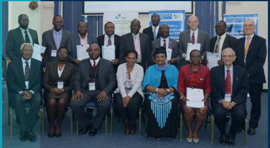
Photo: Four faculty members from Ghana, from UG and from Kumasi Technical University, participated in the RSIF grant writing training at icipe , Nairobi, Kenya in January 2020.

Photo: RSIF host university agreement between UG and icipe , the Regional Coordination Unit for RSIF, was signed in Nairobi, Kenya in presence of the PASET Governing Council and the Executive Director of the PASET Executive Board on the 7 October 2019. Read more