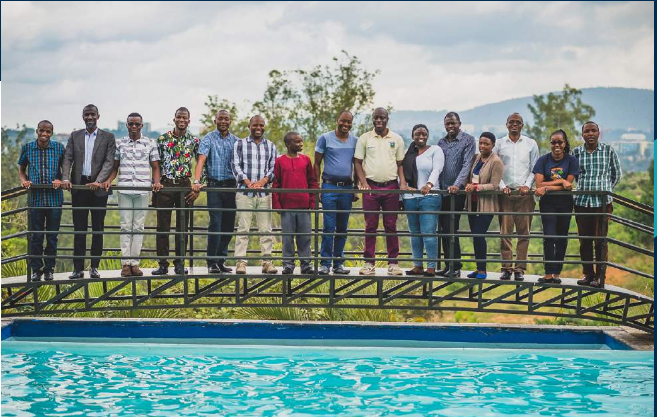
Photo: RSIF cohort 1 scholars