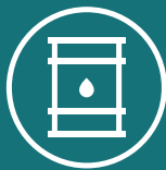
Grease & oil