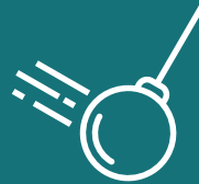
Construction & demolition