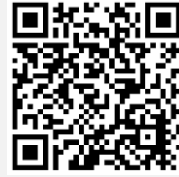
Video of using Inventech Connect

* Note: the efficiency of the electronic conferencing system and Inventech Connect systems depends on the internet systems utilized by shareholders or proxyholders including equipment and/or programs that are installed in such equipment. To ensure the proper performance of the system, please follow the suggestions as follows: