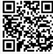
User Manual e-Voting