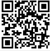
User Manual e-Request