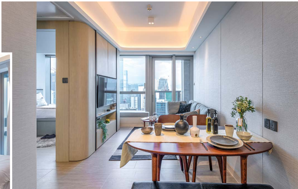
TOWNPLACE SOHO provides inviting designs and flexible leasing options to fit the lifestyle and preferences of millennials TOWNPLACE SOHO提供別緻設計及多元化租賃模式，迎合新世代的生活模式及喜好

集團早前推出全新住宅租賃品牌——「TOWNPLACE本舍」。品牌透過選址、別緻設計、多元化租賃模式、具備完善設施的共享空間以及嶄新智能家居科技等，全方位迎合新世代對自主生活模式的追求，讓他們構建出高度個人化的家居及社區。項目包括早前推出並備受市場歡迎，位於堅尼地城的TOWNPLACE KENNEDY TOWN（前稱雋庭），以及最新位於中環堅道的TOWNPLACE SOHO。