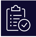
Figure 1. ASC approach to the National Principles for Child Safe Organisations

The ASC is focused on fully embedding the National Principles for Child Safe Organisations and being a leader for child safeguarding. In 2022-23, we achieved best practice implementation across a number of principles. Figure 1 below outlines our approach.