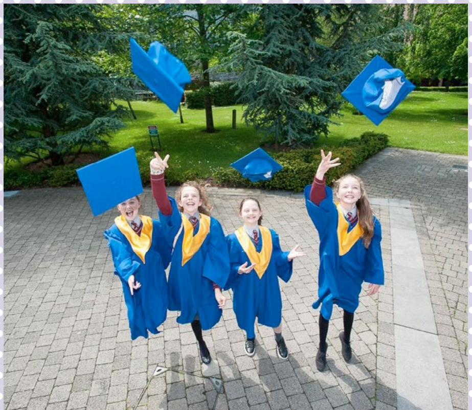
Image: My BFG2EU participants. School of Society, Politics and Ethics.

Funded by ERASMUS+, Communicating Europe and Cork City Council, this Jean Monnet project is an innovative teaching and learning programme to develop awareness, knowledge and debate at primary school level on the EU and Ireland's role within it. Co-constructed with pupils and teachers over two years, it provides a teaching resource for a pupil-centred programme of discussion, discovery and fun.