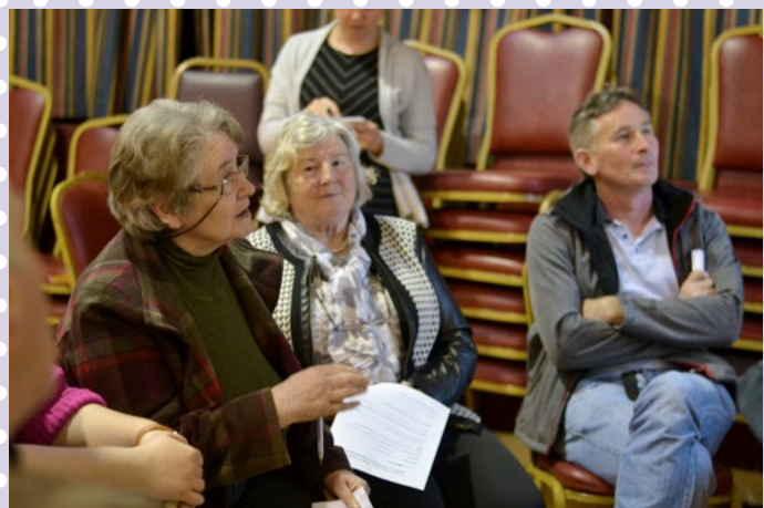
Centre for Planning Education and Research; Schools of Human Environment; Society, Politics & Ethics; Applied Social Studies.

Students from the M.Plan collaborate with Cork communities to identify planning issues and opportunities in their own place. A recent project in Glounthaune received recognition for teaching excellence.