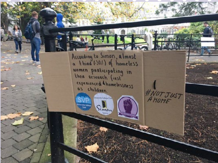
Image: student society placard on campus. School of Applied Psychology.

The largest Trauma Informed research project within a social-care setting in Ireland was delivered in partnership with the HSE's Adult Homeless Integrated Team and Cork Simon Community. Informing policy and service provision, this in-depth research engaged closely with those who experience homelessness. The research continues to inform care advances based on increased awareness of the links between childhood trauma, addiction and homelessness.