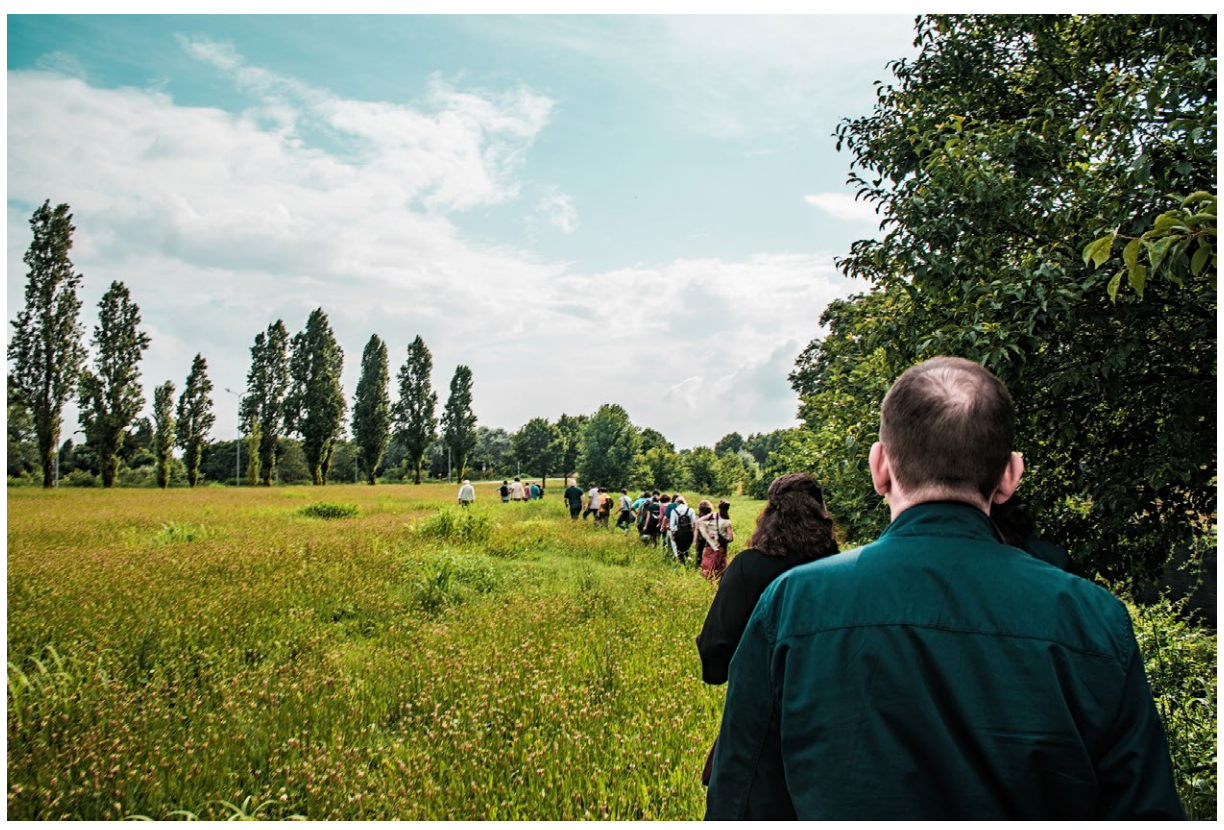
OpenAgri stakeholders meeting (June 2018)

of the project that will be very active and full of activities.