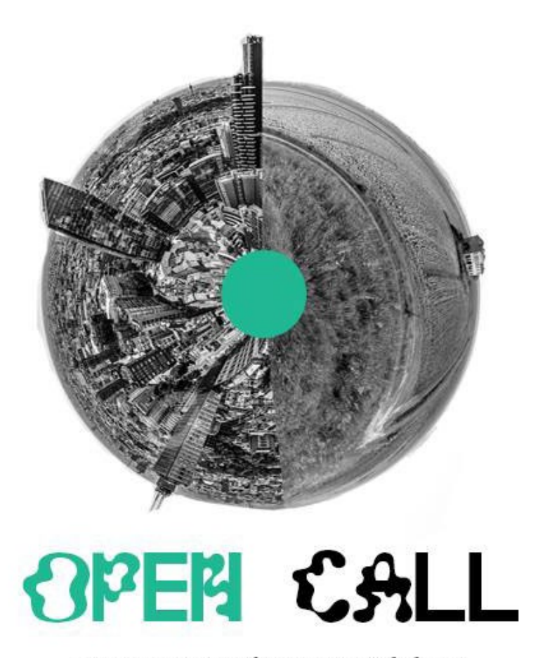
per progetti in residenza artistica dedicata a "OpenAgri – New skills for new jobs in peri-urban agriculture" il progetto europeo che sta attivando un Open Innovation Hub sull'agricoltura periurbana nell'ambito di Nosedo – Porto di Mare – Chiaravalle, a Milano.

To activate the Open Innovation Hub, OpenAgri launched in October 2018 an open call with the purpose to select a project in the scope of contemporary artistic languages (such as performance, public and participatory art) for a nine-week long residency, interacting creatively with UIA Openagri's partnership and activities.