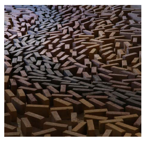
Diversity of compressed earth bricks