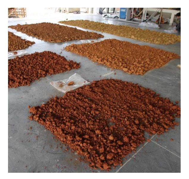
Diversity of earth, Grand Ateliers