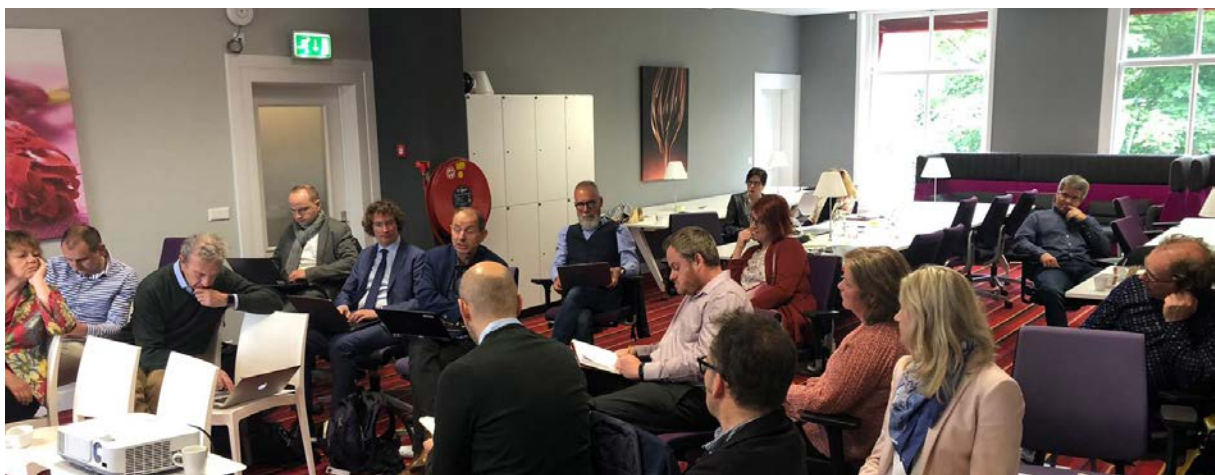
9 th Urban Partnership meeting on May 19-21 st 2019.