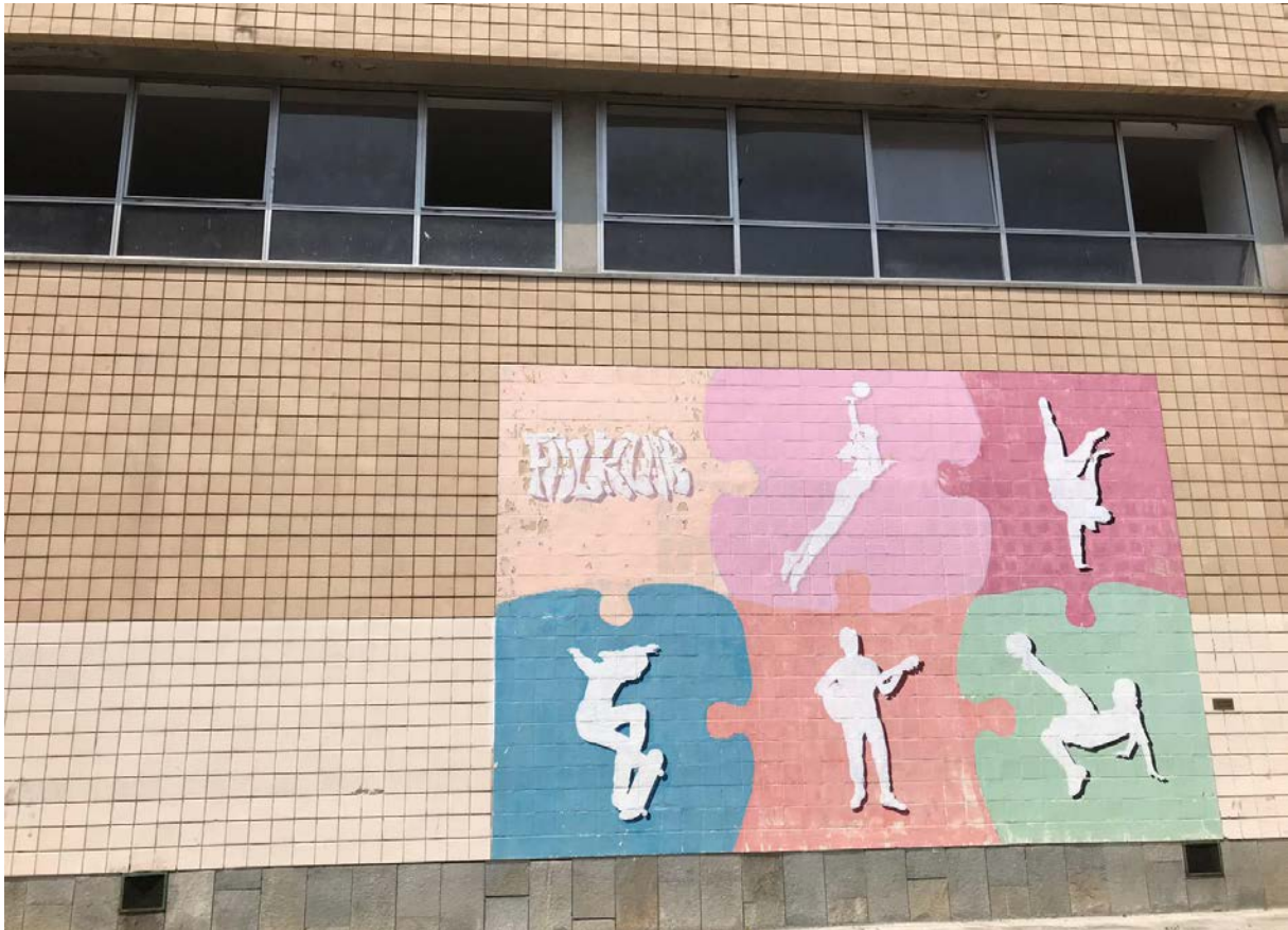
Falklab structure.