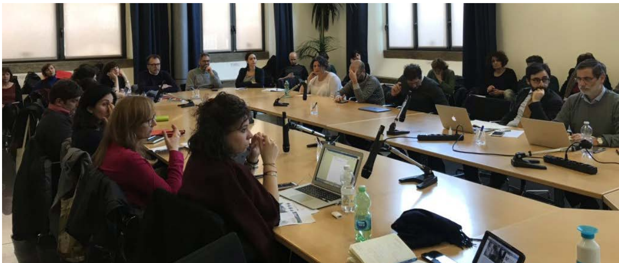
UrbInclusion Workshop_presentation of the policy paper on Innovative Public Procurement based on the Co-City Turin experience, March 7, 2019.

pilot are to raise awareness on this specific model, valorize the experience and main outcomes of the Co-city project while mapping other relevant experiences and promote the drafting of guidelines for city officials. The initialization of the joint pilot action relies upon a scoping paper that was prepared, presented and discussed in three meetings: the UrbInclusion Local Support Group (March 7, 2019); the Economic Development Forum organized by the EUROCITIES network in Florence (March 27-28 th 2019); the 9th Urban Partnership meeting on May 19-21 st 2019.