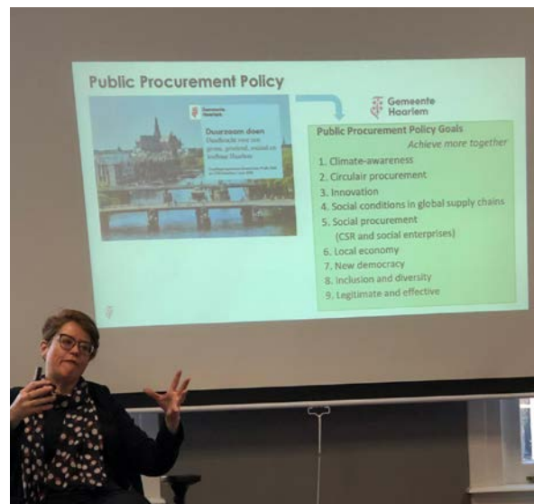
8 th Urban Partnership meeting on January 21-22 nd 2019..