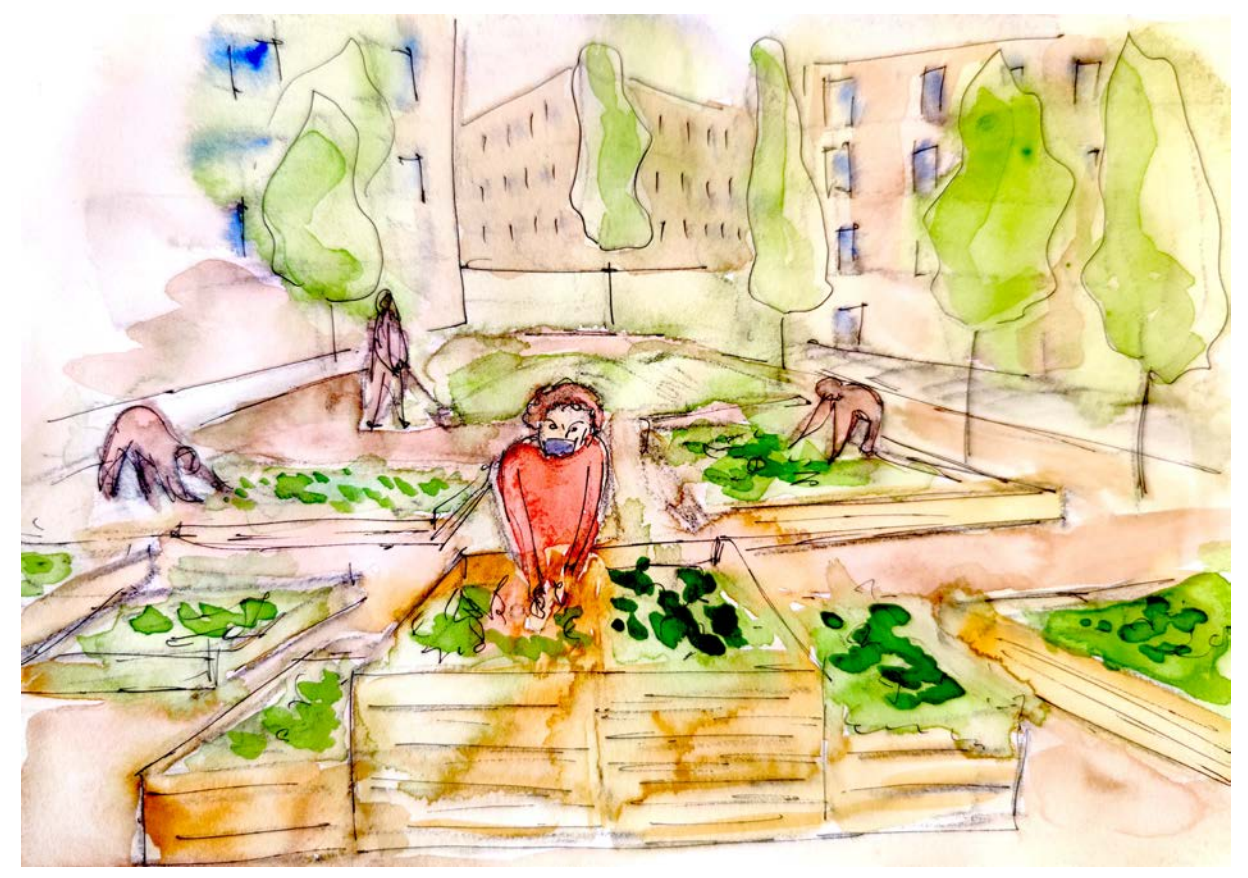
Community gardens.