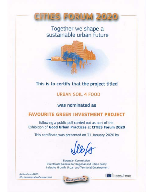
CITIES Forum 2020 Award Certificate - URBAN SOIL 4 FOOD

The Vice Mayor also highlighted how important it was to increase the exchange with other European cities, as there are many new ideas and potential for cooperation.