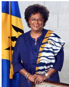
H.E. Ms. Mia Mottley

Convened by the UN SG 24 Sept. 2024 13:30-15:15 ECOSOC Chamber, UN HQ