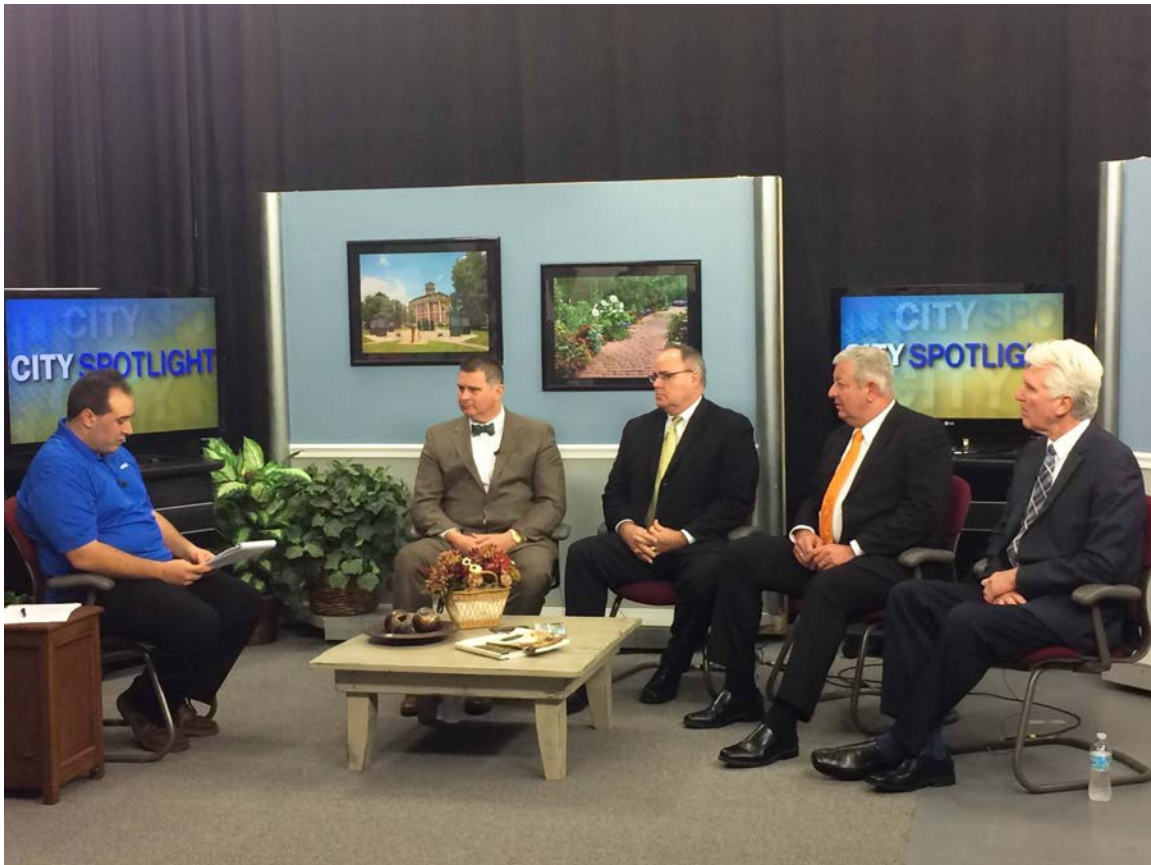
Live one hour, City Spotlight on Effingham, from April 2017.

City Spotlight features area community leaders from government and education. Each program is focused on one town. Viewer and guest response has been positive. City Spotlight has worked well as a resource for future editions of “Our Story”. City Spotlight, in four plus seasons has featured 12 communities from Central and East Central Illinois.