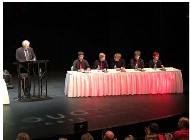
Charleston High School