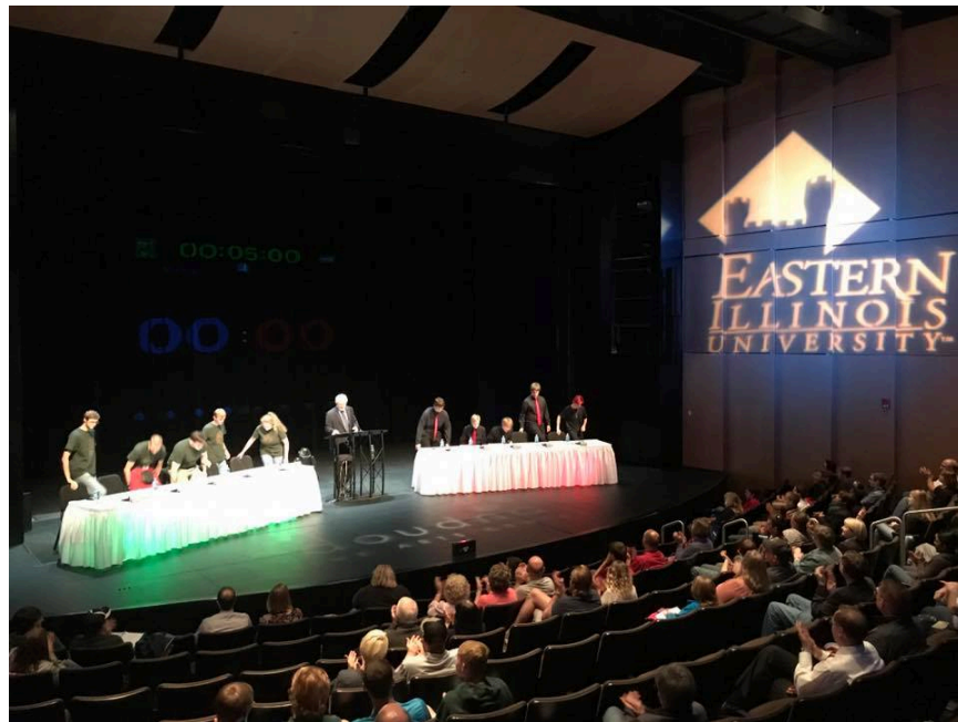
Scholastic Bowl at EIU being recorded for broadcast

The Coles County Scholastic Bowl between Charleston and Mattoon High Schools, competed on Wednesday night, September 13, 2017, at the Doudna Fine Arts Center at Eastern Illinois University. #WEIU will have the complete match for viewing, this Saturday at 12pm, as well as a re-air on Sunday at 5pm. Mattoon Community Unit School District 2 Charleston Community Unit School District 1