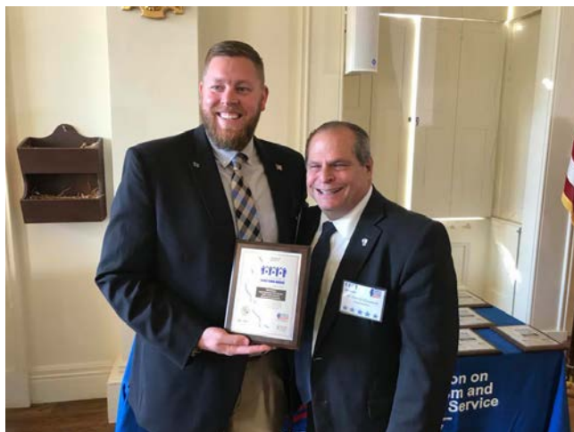
Charleston, IL Mayor and EIU President