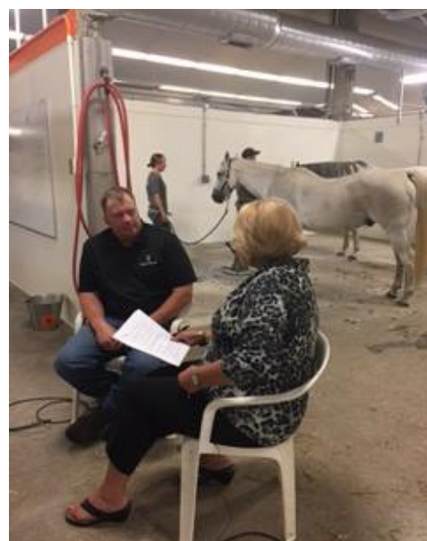
University of Illinois Veterinary Teaching Hospital