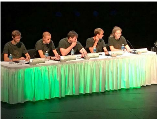
Mattoon High School