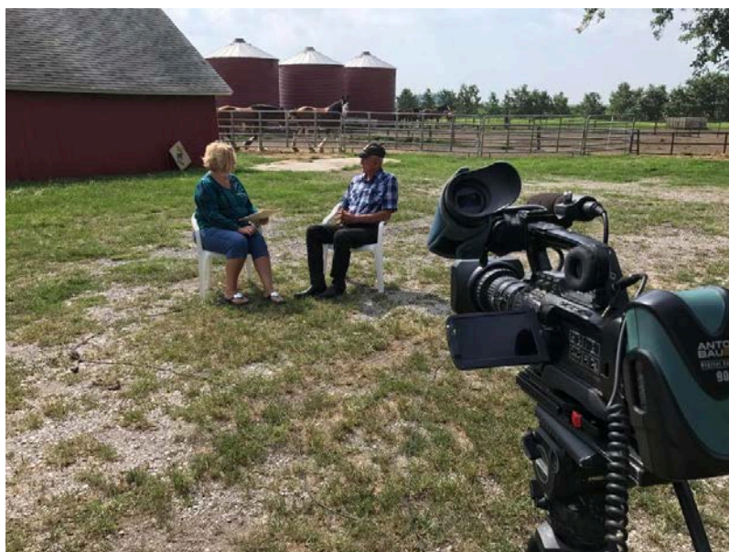
Farrell Farms near Lovington, IL.