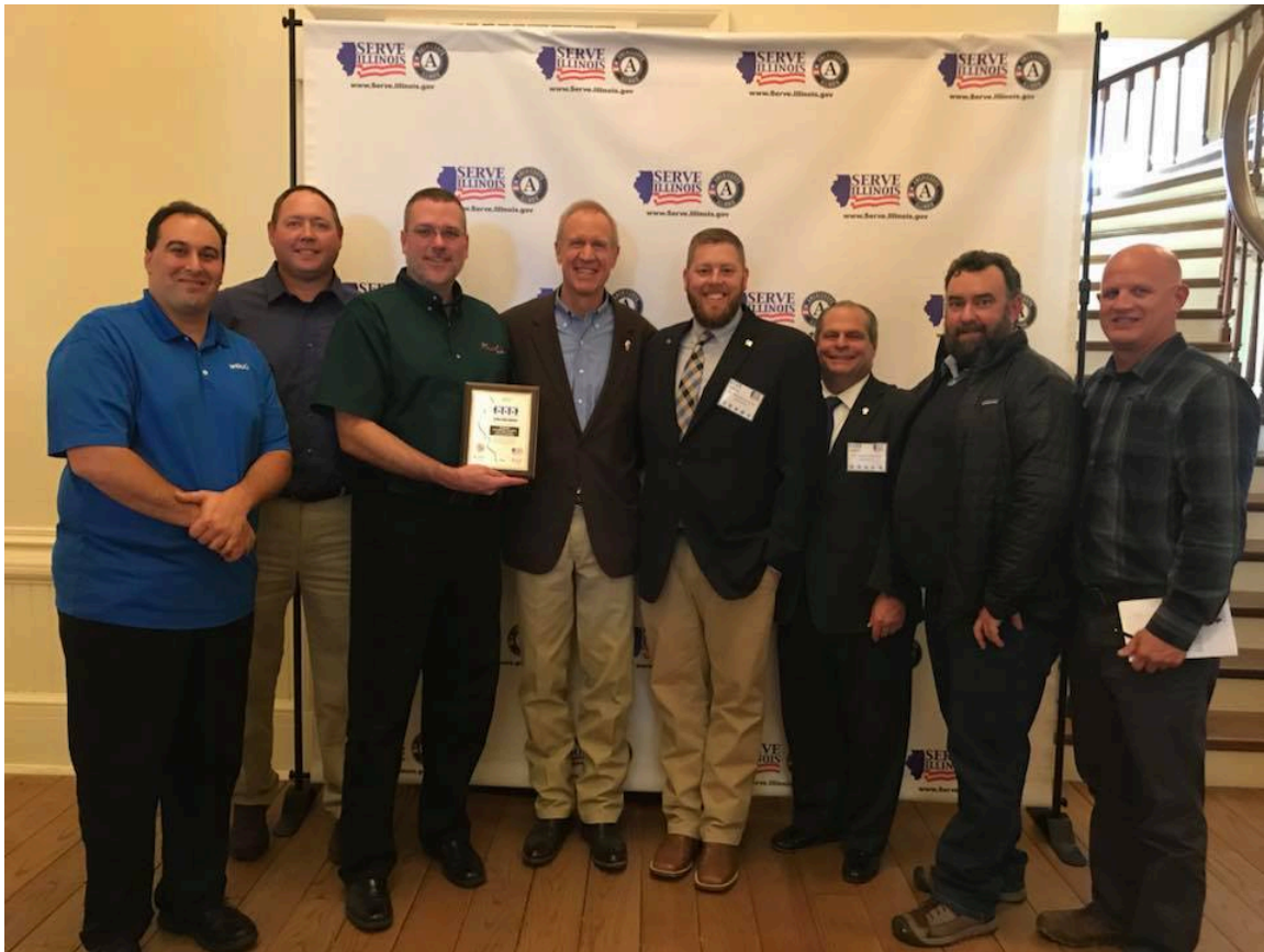
WEIU Producer, Governor of Illinois, Charleston City Officials & EIU President

Charleston: 2017 Governor's Hometown Award Video. Charleston, Illinois , is a recipient of a 2017 Illinois Governor's Hometown Award, for the recent work done at the Lake Charleston Trails. #WEIU and the City of Charleston collaborated to make this video, highlighting the recent work done on the Lake Charleston Trails.