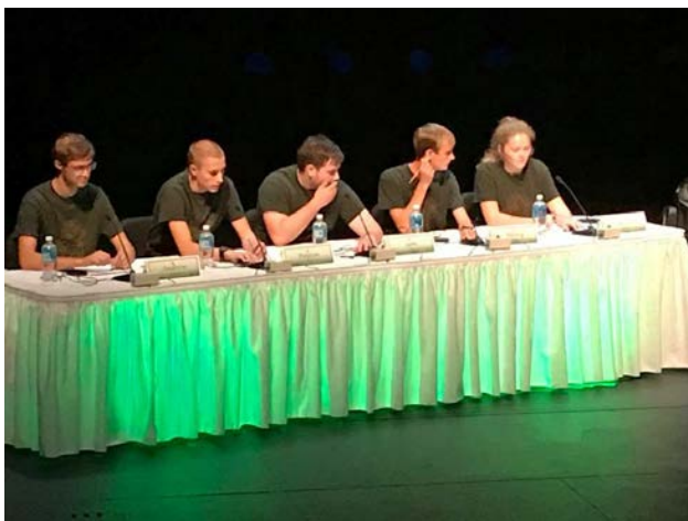
Mattoon High School