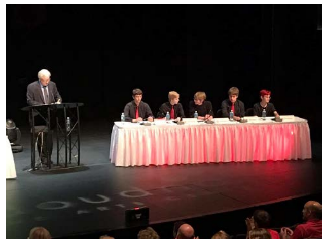
Charleston High School