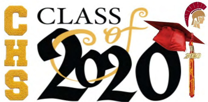
Charleston and Mattoon Virtual Graduations – WEIU was an outlet for locally produced virtual graduations to air honoring local high schools in Charleston and Mattoon, Illinois.

Both virtual graduations combined – 2.25 hrs