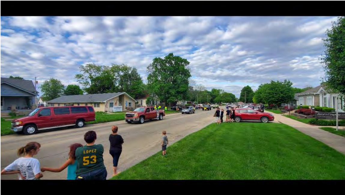
2020 Mattoon High School Seniors Parade – WEIU and Cromwell Radio Group in Mattoon, Illinois, collaborated on a 23-minute video, highlighting a parade to honor the 2020 Mattoon High School Senior Class.