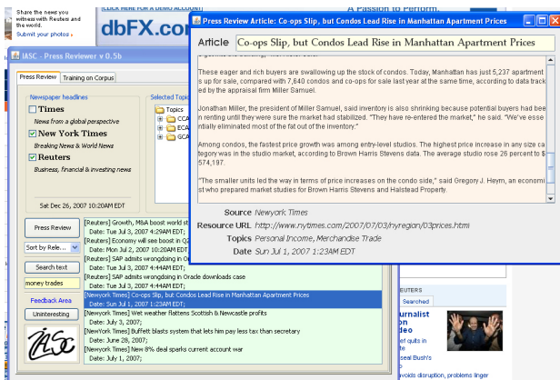
Fig. 1. An example of results provided by the personalized press review system.

The World Wide Web offers a growing amount of information and data coming from different and heterogeneous sources. As a consequence, it becomes more and more difficult for Web users to select contents according to their interests, especially if contents are frequently updated (e.g., news, newspaper articles, Reuters, RSS feeds, and blogs). Supporting users in handling the enormous and widespread amount of Web information is becoming a primary issue. To this end, several online services have been proposed (e.g., Google News 5 and PRESSToday 6 ). Unfortunately, they allow users to choose their interests among macro-areas (e.g. economics , politics , and sport ), which is often inadequate to express what the user is really interested in. Moreover, existing systems typically do not provide a feedback mechanism able to allow the user to specify non-relevant items—with the goal of progressively adapting the system to her/his actual interests.