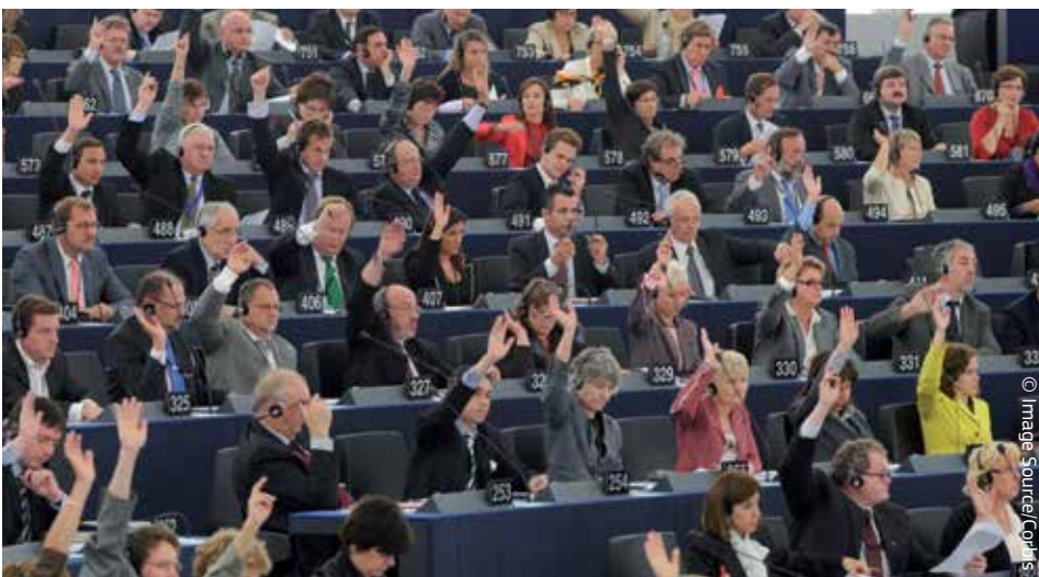
The European Parliament — this is where you can make your voice heard.

In 2011, a German, Martin Schultz (Progressive Alliance of Socialists and Democrats), was elected President of the Parliament for a period of two and a half years.