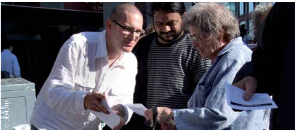
A more democratic Europe: thanks to the Lisbon Treaty, European citizens can now propose new laws.

The European Council fixes the EU's goals and sets the course for achieving them. It provides the impetus for the EU's main policy initiatives and takes decisions on thorny issues that the Council of Ministers has not been able to agree on. The European Council also tackles current international problems via the 'common foreign and security policy' — which is a mechanism for coordinating the foreign policies of the EU's Member States.