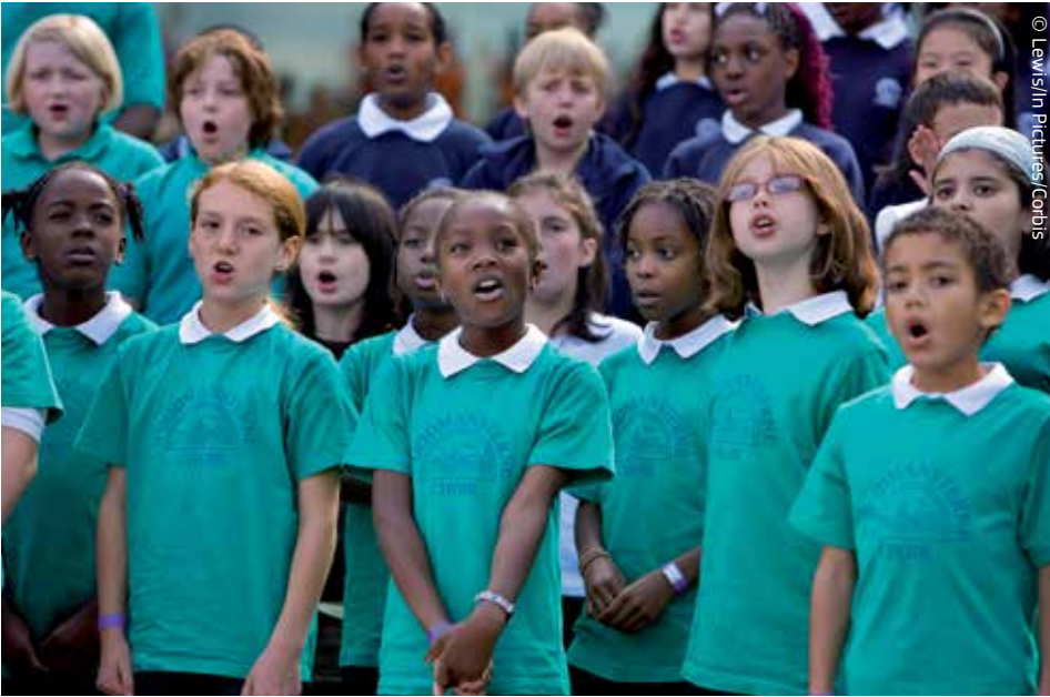
United in diversity: working together achieves better results.

In today's world, rising economies such as China, India and Brazil are set to join the United States as global superpowers. It is therefore more vital than ever for the Member States of the European Union to come together and achieve a 'critical mass', thus maintaining their influence on the world stage.