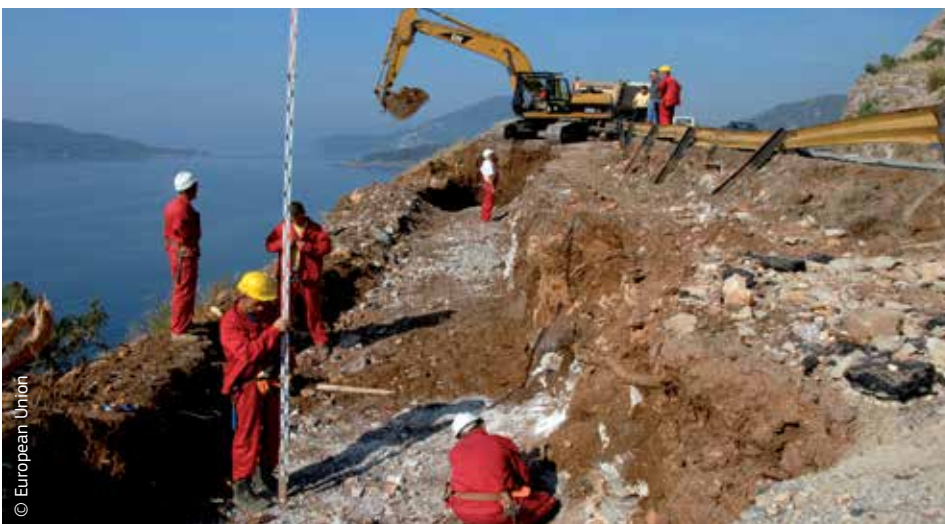
The EU gives financial aid to help build the economy in neighbouring countries.

The EU's financial assistance to both groups of countries is managed by the European Neighbourhood and Partnership Instrument (ENPI).