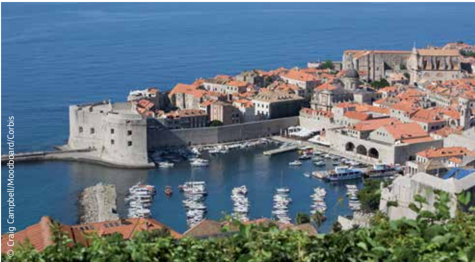
The 'Pearl of the Adriatic' — Dubrovnik in Croatia, the EU's newest Member State.