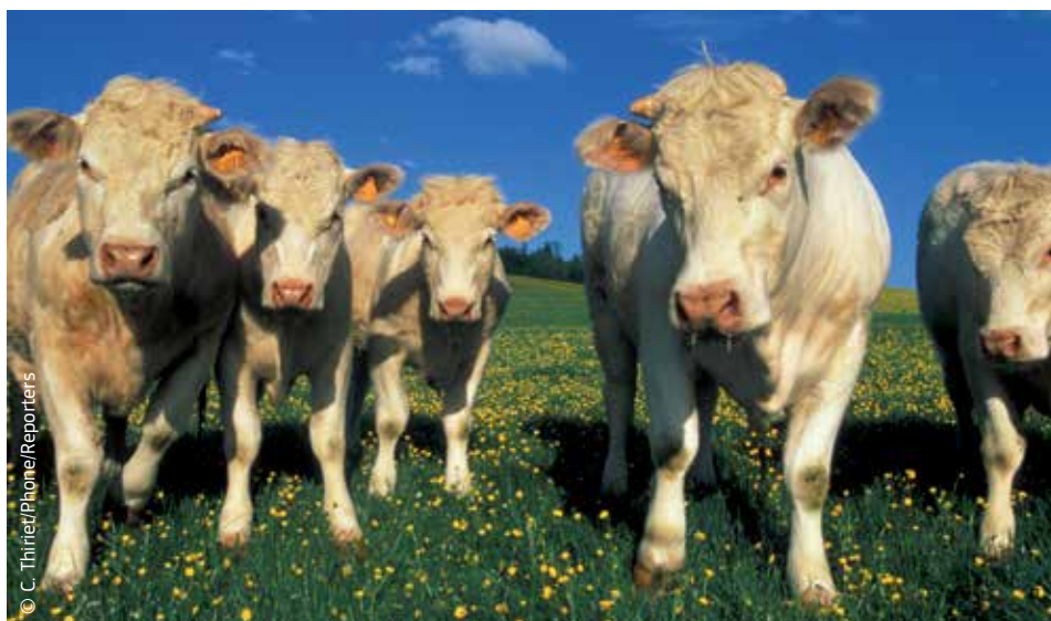
Agriculture must provide safe food of good quality.

The European Commission represents the EU in international negotiations at the World Trade Organisation (WTO). The EU wants the WTO to put more emphasis on food quality, the precautionary principle ('better safe than sorry') and animal welfare.