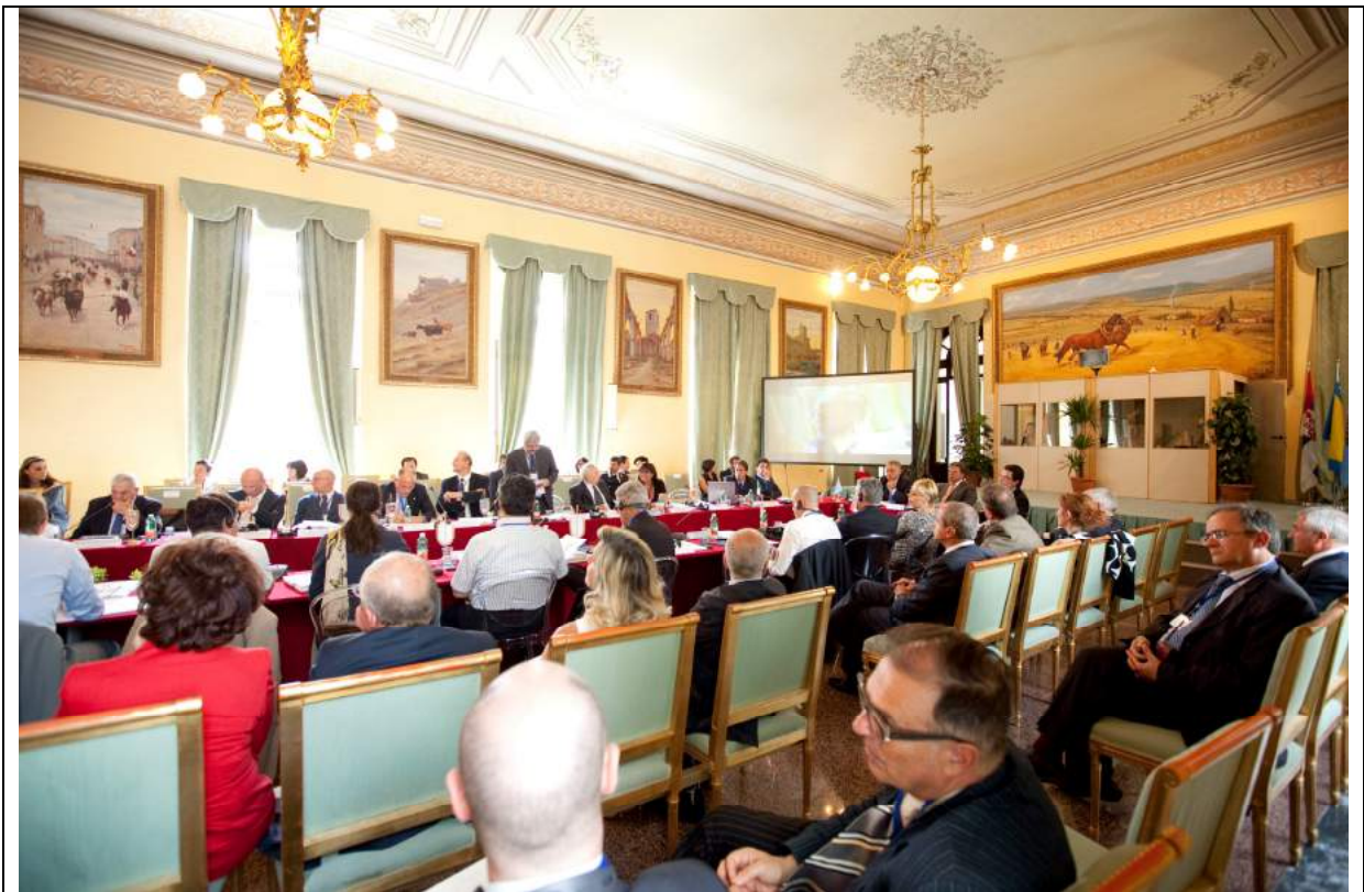
Campobasso, 30 Giugno 2011 – VI General Assembly