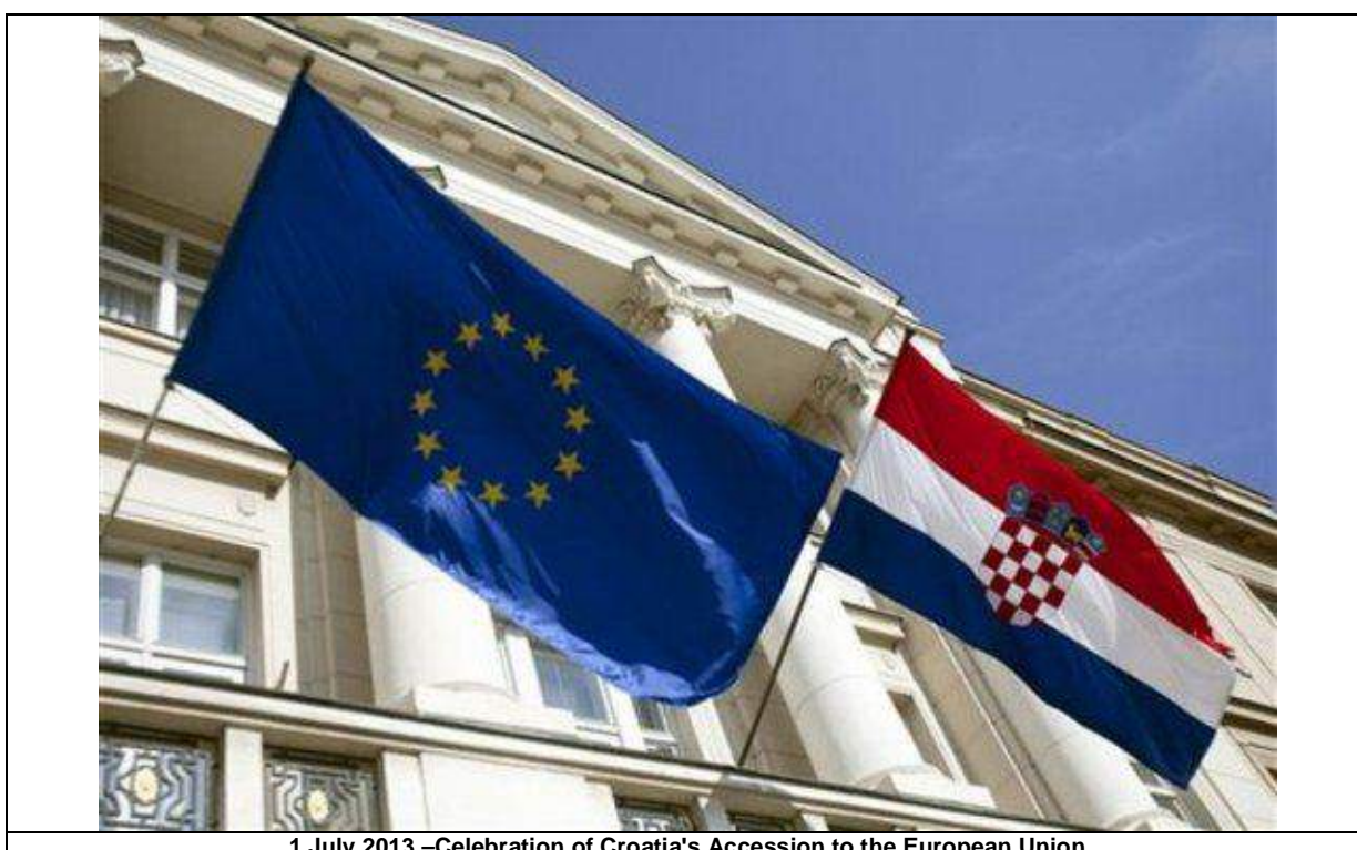
1 July 2013 –Celebration of Croatia's Accession to the European Union

The event called together presidents, politicians and representatives of "friendly" regions such as those belonging to the Euroregion, which have strongly supported Croatia's accession to the EU. The AIE President remarked that in the same place, exactly seven years ago, the Euroregion was officially formed with the contribution of all members. So the President took this opportunity to celebrate the seventh birthday of the Adriatic Euroregion, founded in 2006, on June the 30th , just in the House of Croatian Defenders in Pula.