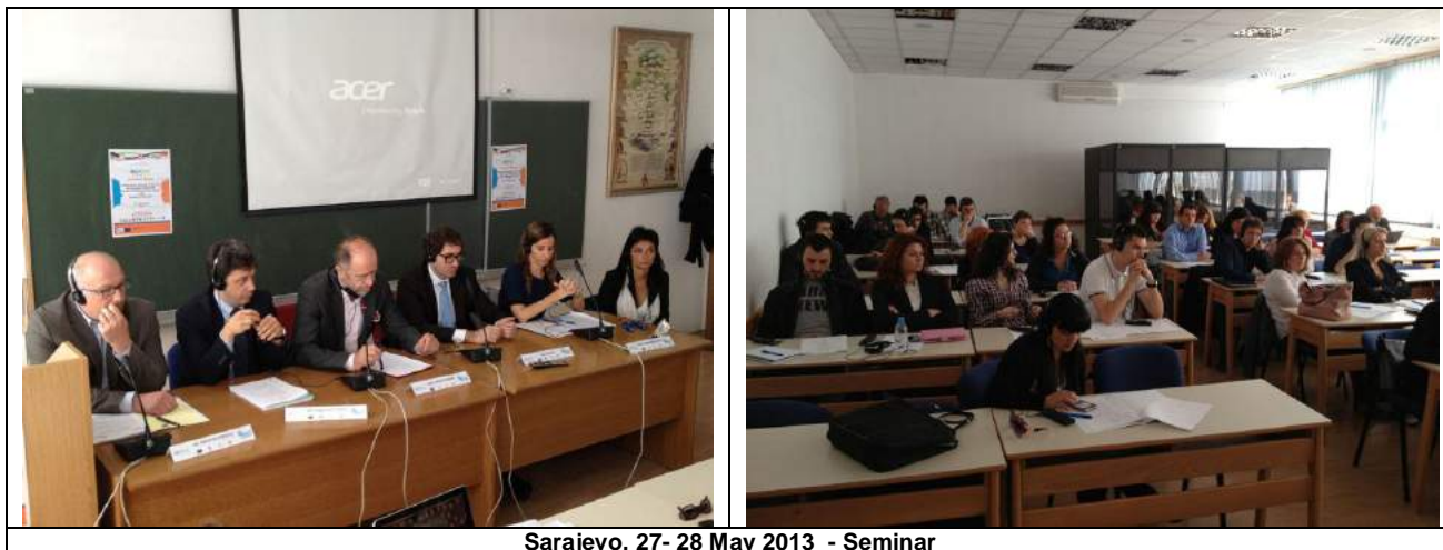
Sarajevo, 27- 28 May 2013 - Seminar