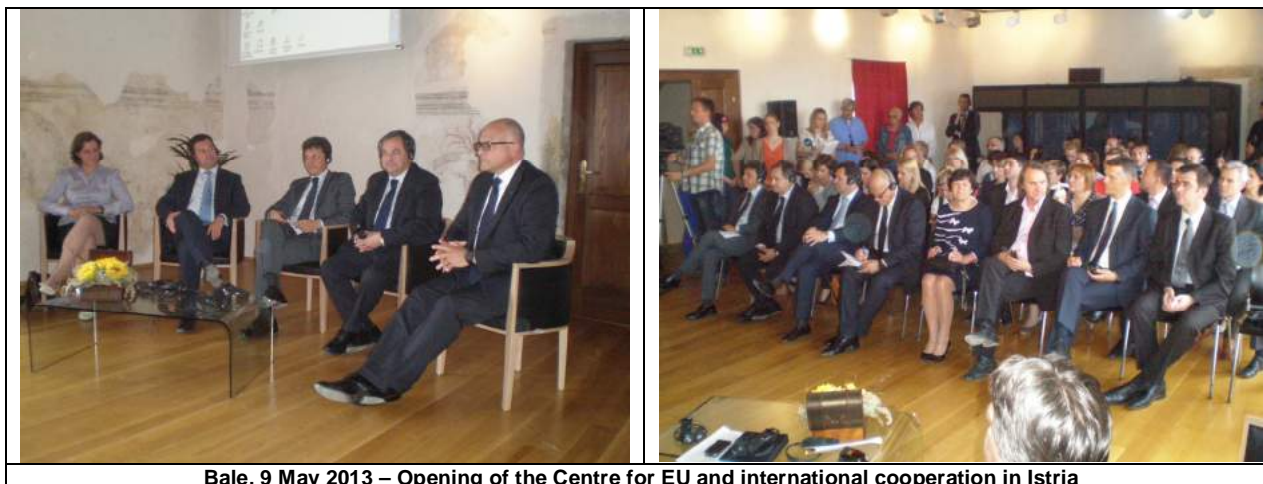
Bale, 9 May 2013 – Opening of the Centre for EU and international cooperation in Istria

After the official opening of the Centre, the event continued with a discussion about the cross-border cooperation, the strategic projects of IPA Adriatic CBC programme and the new CBC programmes in the next EU programming period, as well as, the future perspectives of the Adriatic-Ionian Euroregion. In this regard, the main topic was the European Group of Territorial Cooperation (EGTC) and the new AIE memberships that are enlarging in a positive way the composition of the association.