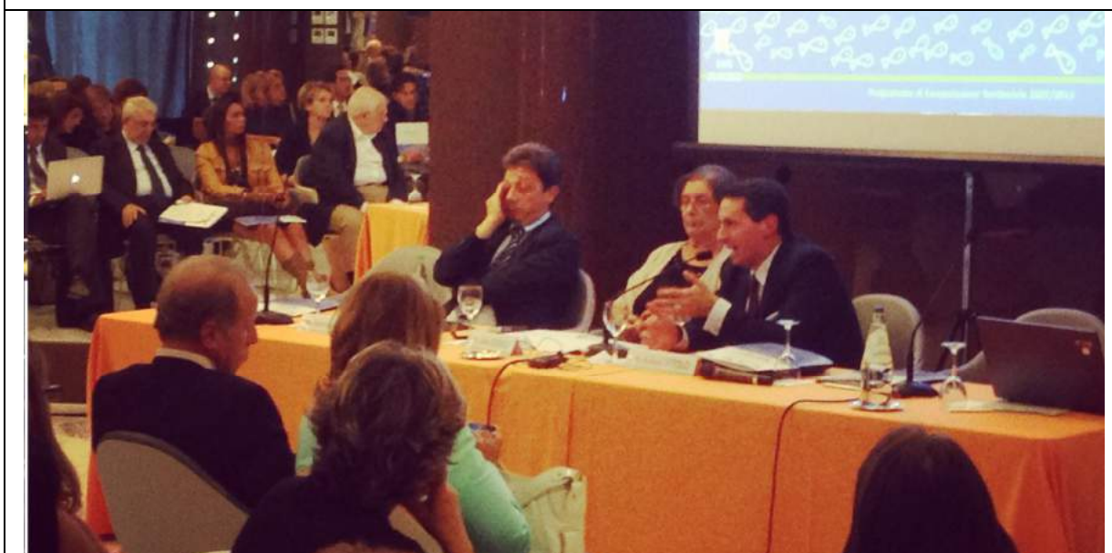
Bari, 25 September 2013