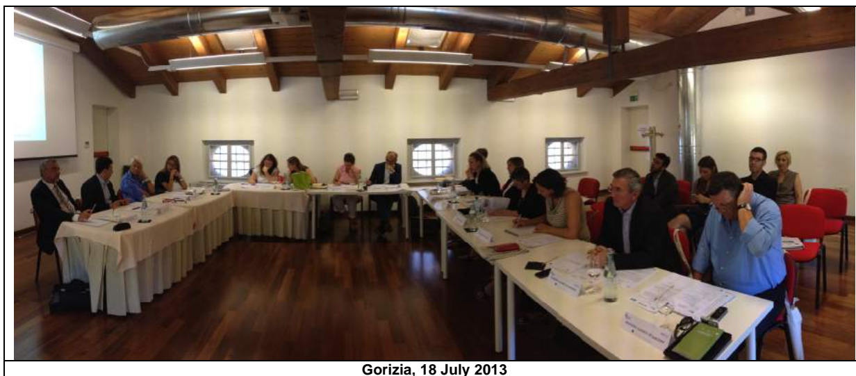
Gorizia, 18 July 2013

Thanks to the wide partnership, covering almost all the area concerned by the Macro-regional strategy, this Laboratory may play a strategic role for the development of the Strategy itself, as far as all the project partners are at the same time members of the macro-regional internal commissions dealing with the different topics of strategy.