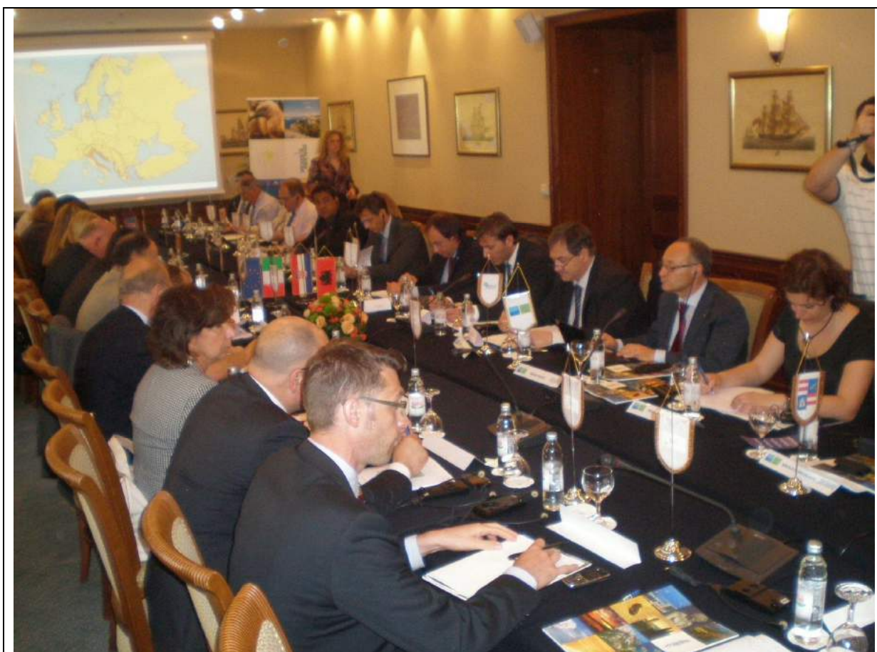
Rijeka, 8 May 2013 – Commission on Transport and Infrastructure

The four-year working program of the Transport and Infrastructure Commission has been introduced to the AIE members. During the meaningful debate which involved most of the participants, the development phase of EU Adriatic-Ionian strategy has been one of the main topic and it was highlighted how the four-year working program presented by the AIE commission is very coherent with the EU strategy and it is an integral part of it.