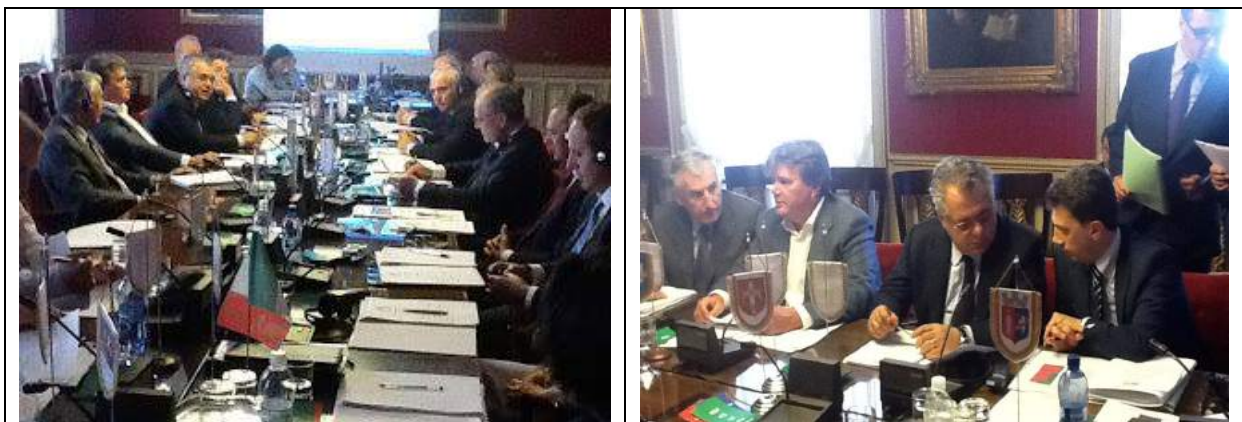
Trieste, 13 June 2012 – VII General Assembly