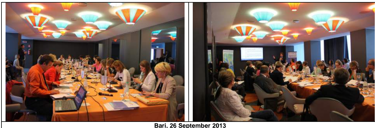
Bari, 26 September 2013