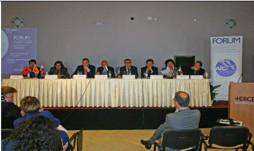
Medjugorje, 14 – 16 May 2013