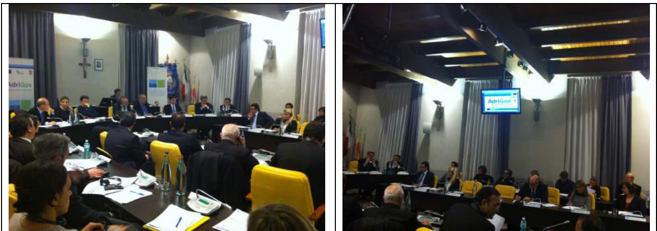
Termoli, 14 January 2013 – Round table

AdriGov partnership is composed by thirteen institutional partners, (Italian regions and local authorities from the cross-boarder countries). Project lengths is 2 years and it aims to enhance good governance practices in the area. The project encourage and support the initiatives of cross-border cooperation in the field of culture, commerce, industry, tourism and fisheries as well as, the protection and preservation of the environment.