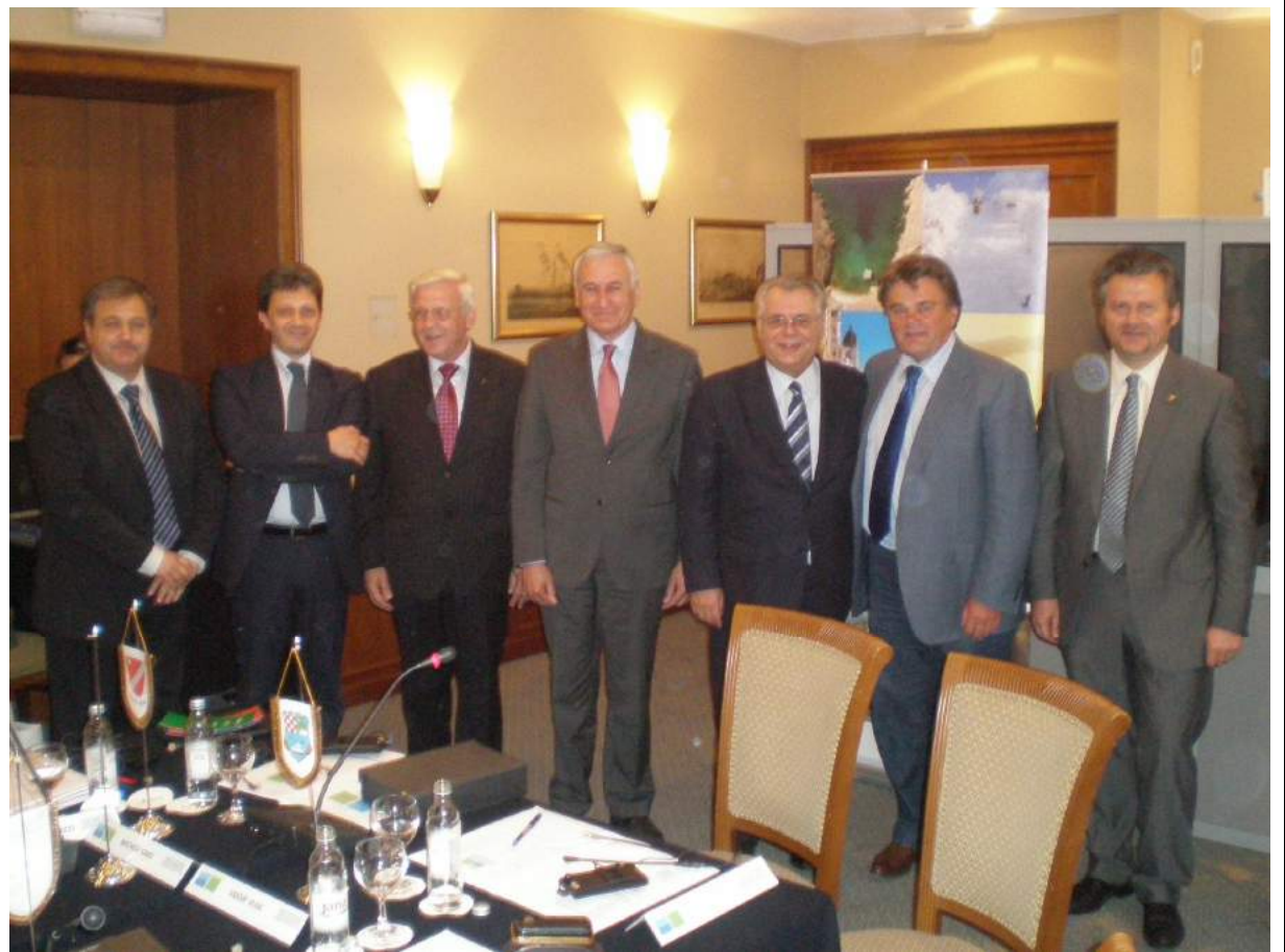
Rijeka, 8 May 2013 – Executive Committee