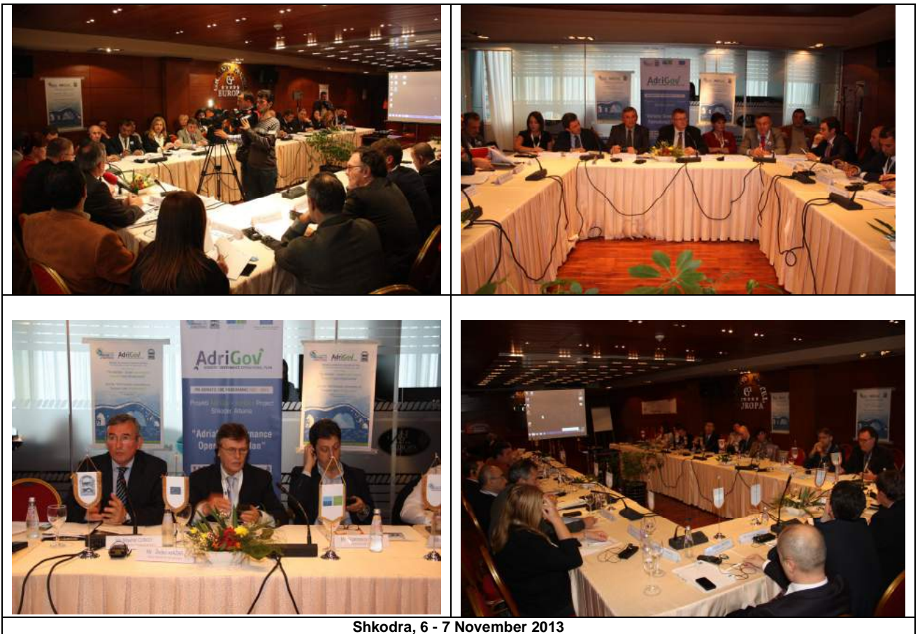
Shkodra, 6 - 7 November 2013

The two days event was attended by AIE members, Albanian politicians and local administrators. Participants agreed that it is necessary to increase the investments in the field of transport, ports and regional airports. Common projects in this field could represent a driving force for our cooperation area.