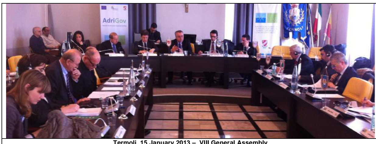
Termoli, 15 January 2013 – VIII General Assembly

During the eighth AIE General Assembly, members have also decided to schedule the Thematic Commissions with the support of AdriGov project. Members has decide to create specific working groups with the aim to define common proposal on tourism, transports, safety, culture and higher education, fishing, environmental protection, territorial development and trade. At the end, the Assembly approved the proposal financial budget of the Euroregion.