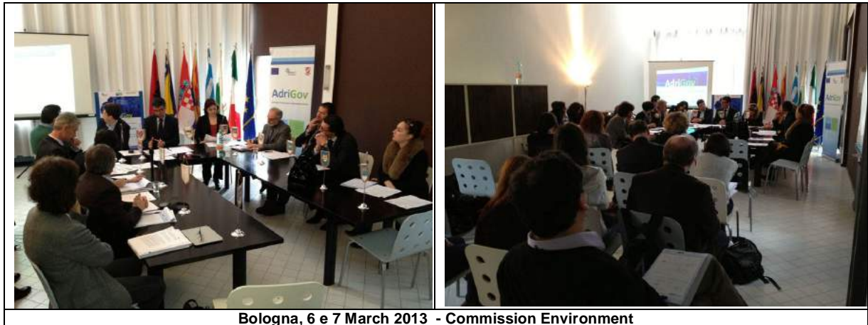
Bologna, 6 e 7 March 2013 - Commission Environment

The two days were organised in the framework of the activities of AdriGov project led by Molise Region and financed under the IPA Adriatic CBC Programme.