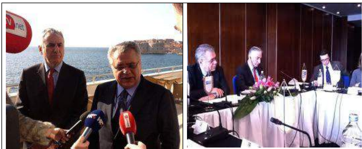
Dubrovnik, 23 January 2012 – Executive Committee