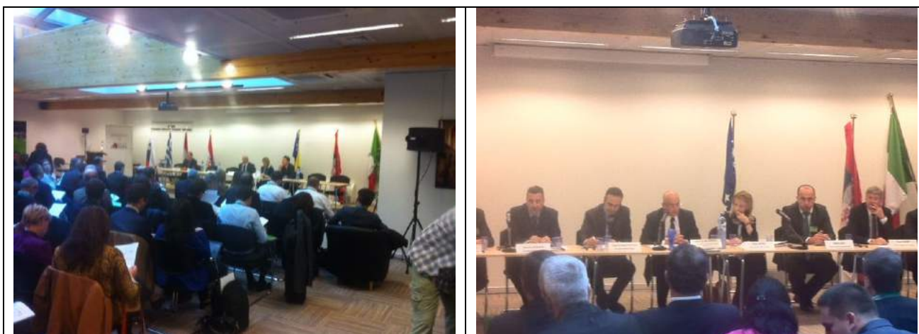
Brussels, 7-11 October 2013 - Open Days

In the framework of Open Days 2013, a conference entitled “Adriatic-Ionian Macroregion: from strategy to action” took place in Brussels at Espace Monte Paschi on 9 October.