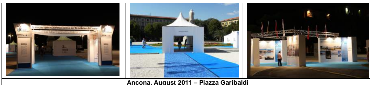
Ancona, August 2011 – Piazza Garibaldi

The Adriatic Euroregion awaits the whole event with its own promotional stands, giving to all interested parties information about networks and distributing its own gadgets, brochures and promotional material.