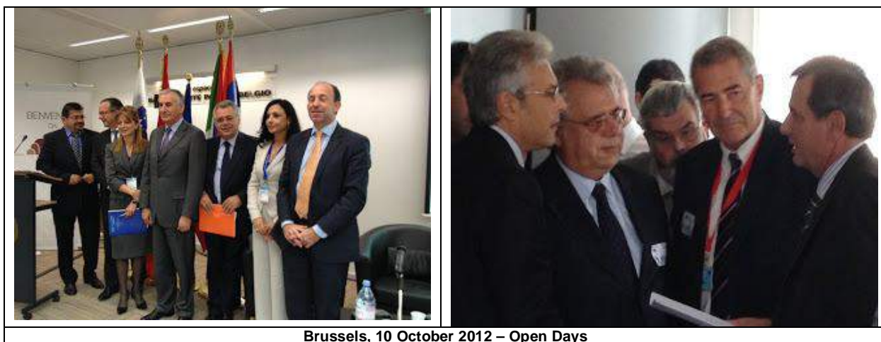
Brussels, 10 October 2012 – Open Days

It has been long debated about the Macro - Region. It was a unique opportunity not only for the visibility in a European scenario, so qualified as the Open Days is, but also for the prestige that covers the Adriatic Euroregion in representing the needs along with the several requests of the public bodies in the Adriatic area who want to collaborate in the creation of the Macro- Region.