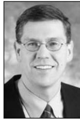
Majority Leader Erik Paulsen