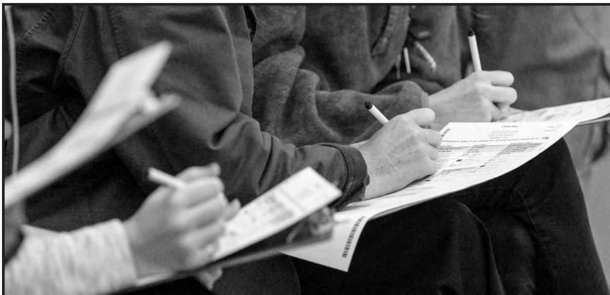
Citizens consider their votes at the Historic Streetcar Station near Como Park Tuesday, Nov. 8.

This document can be made available in alternative formats for people with disabilities by calling 651-296-2146 or 800-657-3550 toll-free (voice).